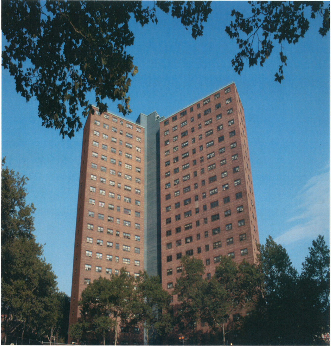
Manhattanville Houses, Borough of Manhattan