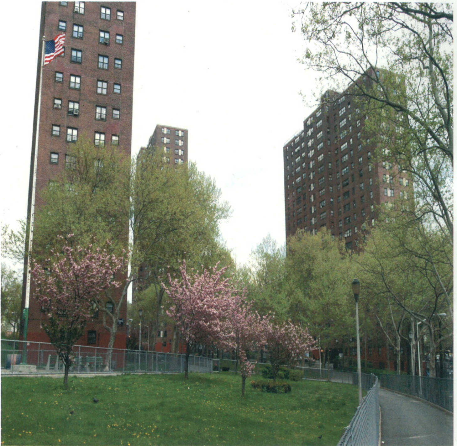
Saint Mary's Park, Borough of the Bronx