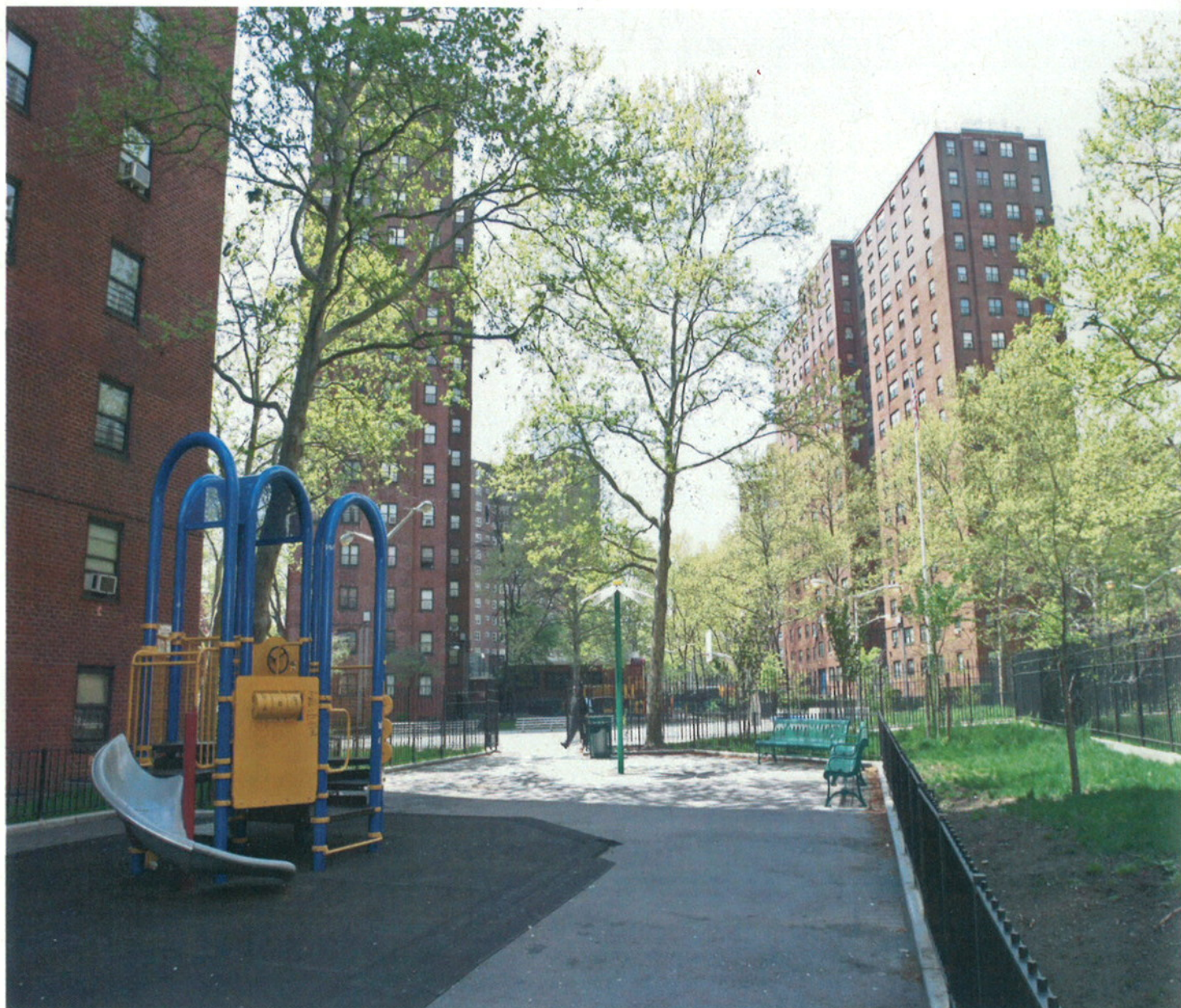
Andrew Jackson Houses, Borough of the Bronx