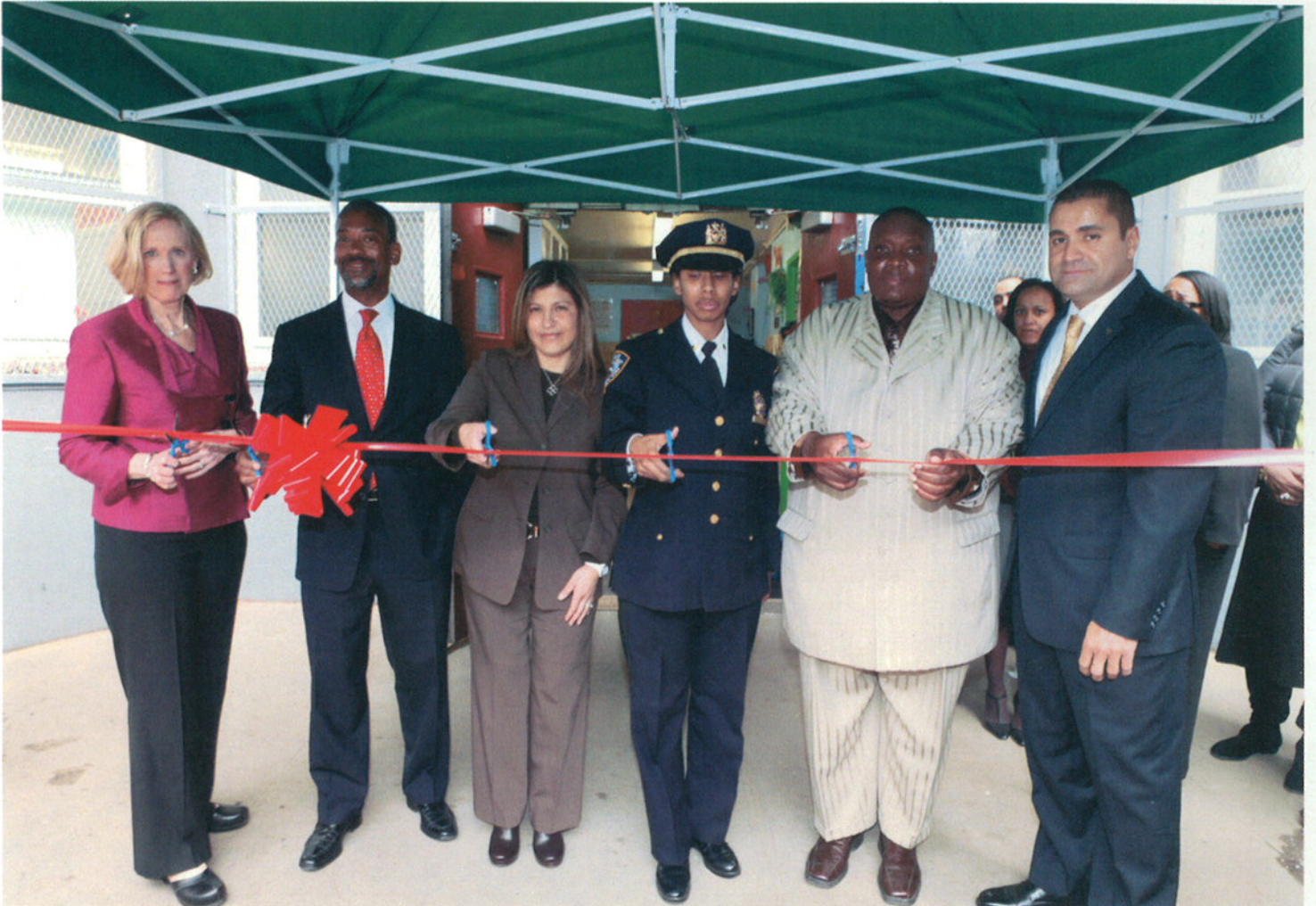
Albany Houses Teen Impact Center Ribbon Cutting February 24, 2011