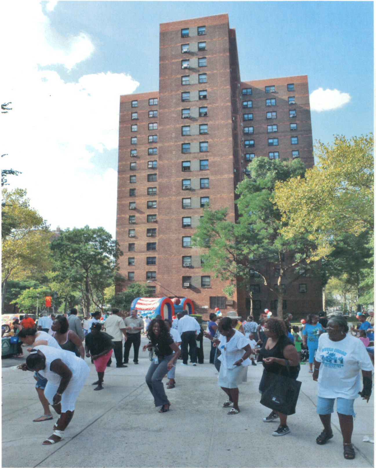
Wagner Houses, Borough of Manhattan