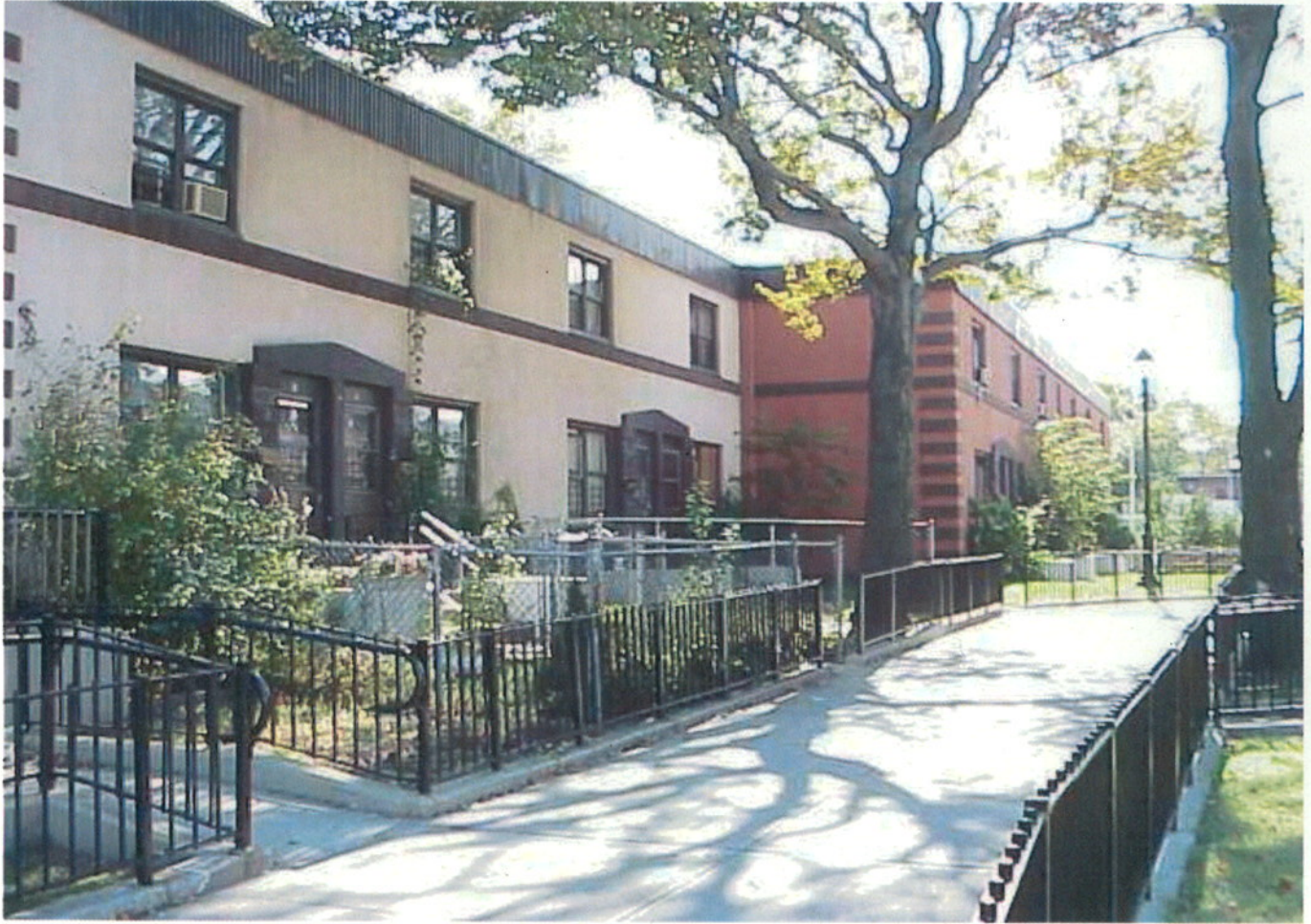
Markham Gardens, Borough of Staten Island