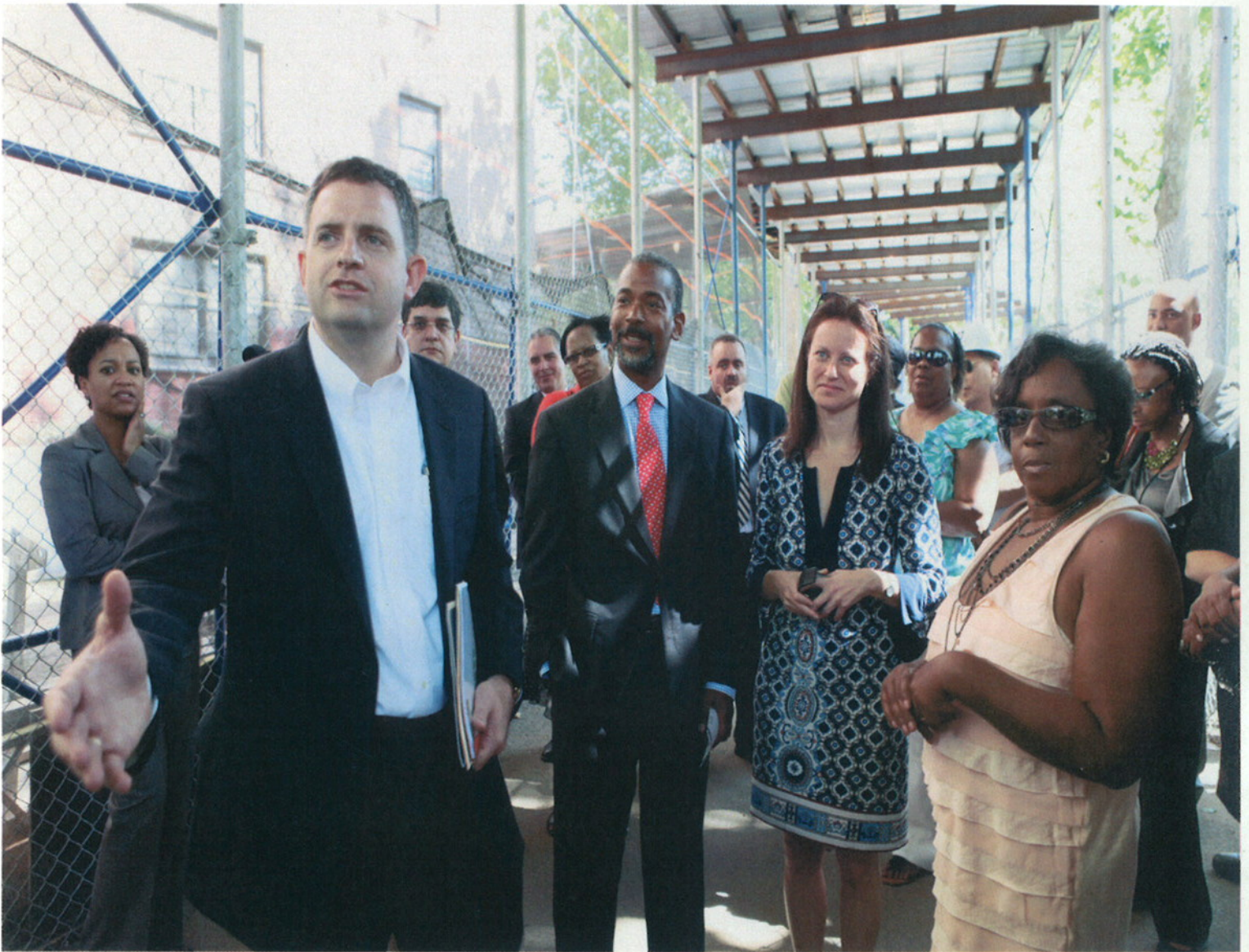
ARRA Stimulus Funds Marlboro Houses August 24, 2011