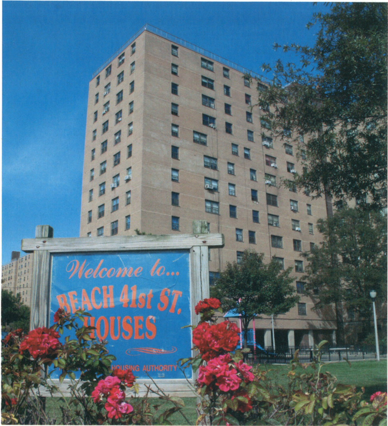
Beach 41 st Street Houses, Borough of Queens