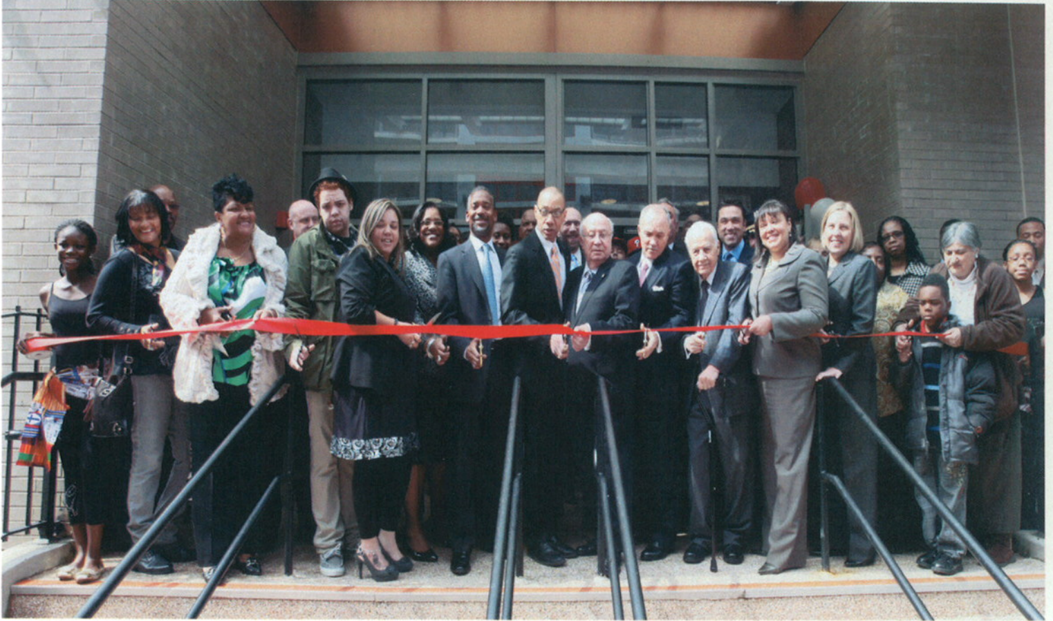
Gerard Carter Community Center Ribbon Cutting Ceremony April 4, 2011