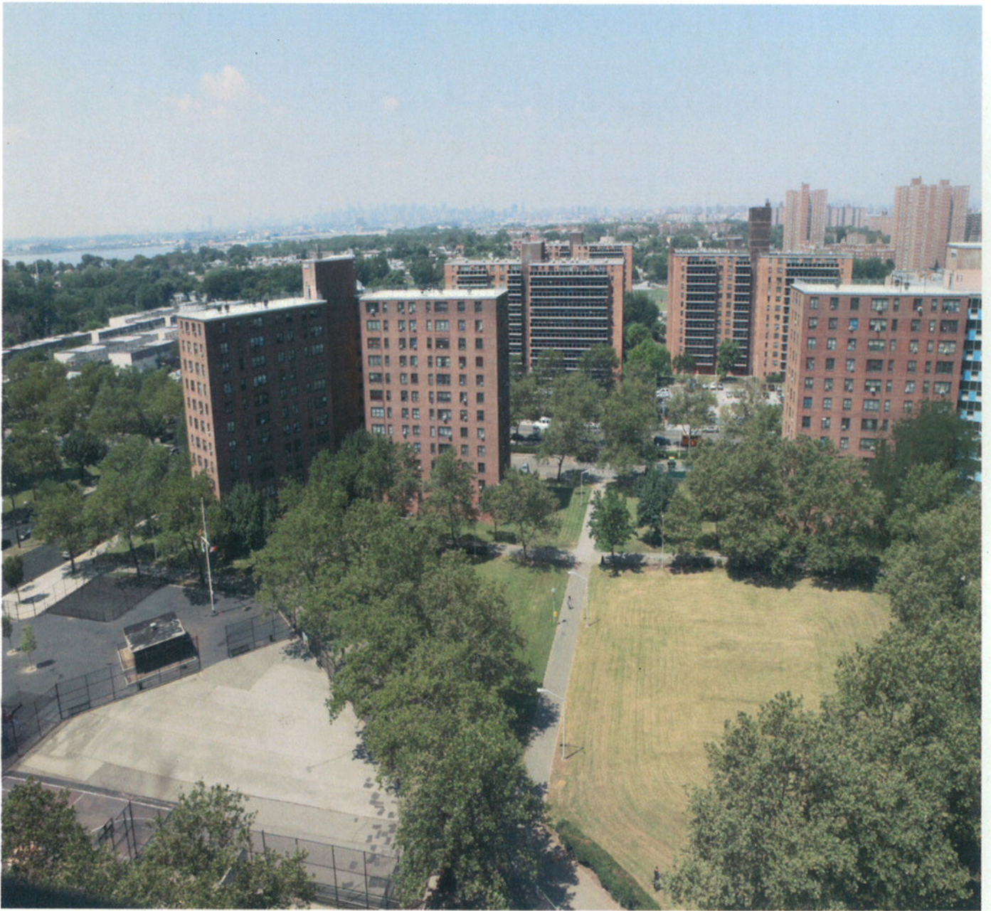
Castle Hill Houses, Borough of the Bronx