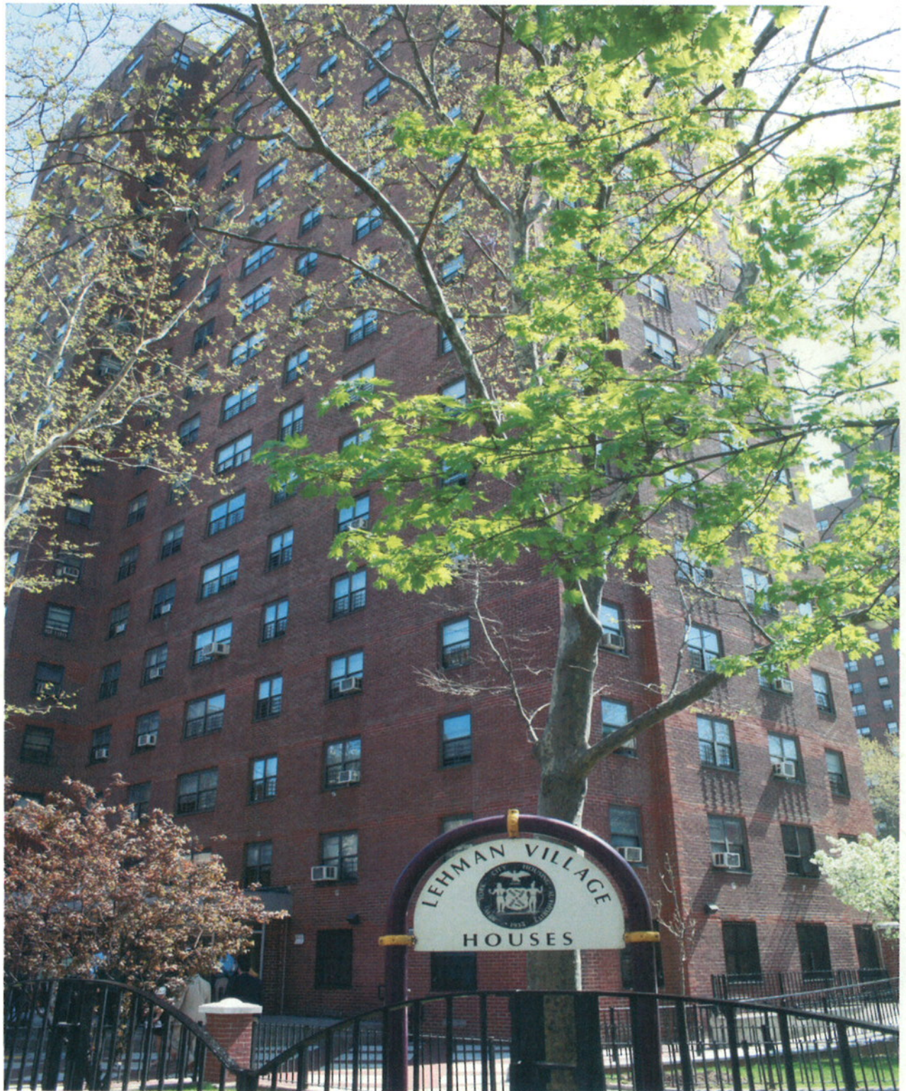
Lehman Village Houses, Borough of Manhattan