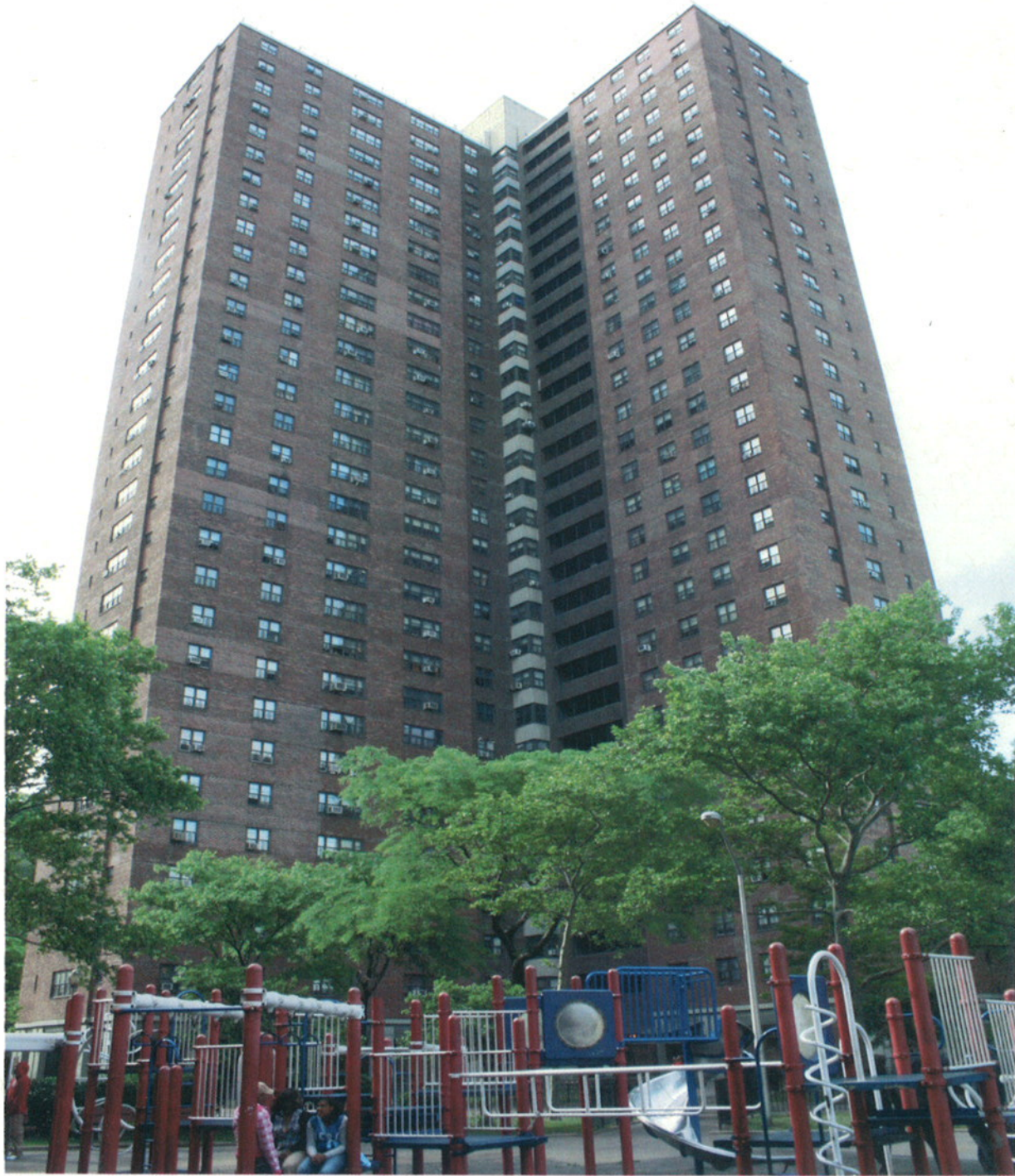
Polo Grounds Towers, Borough of Manhattan