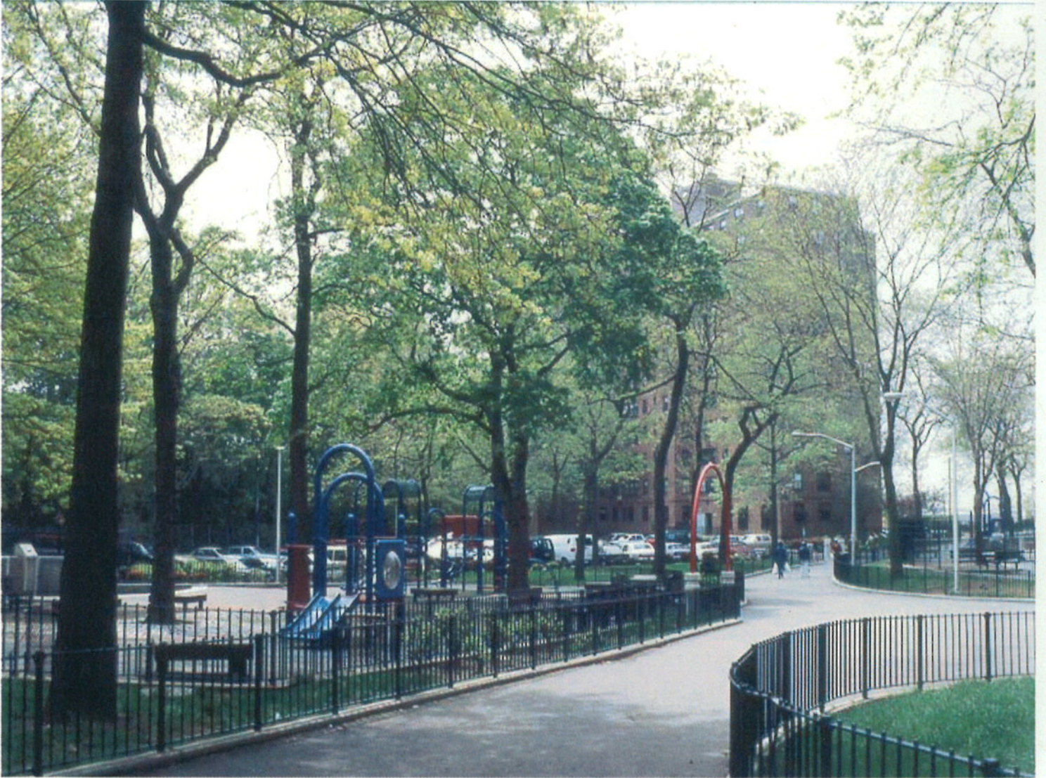
Bland Houses, Borough of Queens