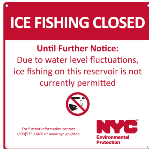
Example of Ice Fishing Restricted Sign

During the shutdown, ice fishing will be restricted on several reservoirs since water levels will fluctuate due to higher use in winter months. This fluctuation can cause a gap to form between the frozen surface and the reservoir's water level, creating unsafe conditions. Therefore, on reservoirs where this is possible, DEP will restrict ice fishing during the tunnel shutdown period. Please visit the DEP website for an updated list of reservoirs closed to ice fishing, and always obey any notices or signs posted in the field.