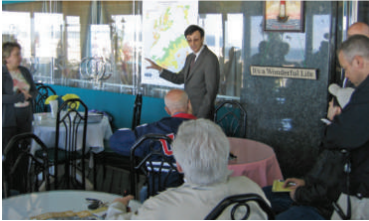
Commissioner Bruno addresses the crowd at the conclusion of Hurricane 2006.