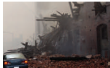
May 2006 10-alarm fire in Greenpoint

Collect and disseminate critical information