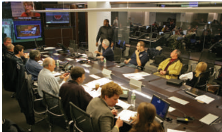
Mayor Bloomberg, Deputy Mayor Ed Skyler, City commissioners, and OEM staff meet in the Situation Room during the April 2007 nor'easter.