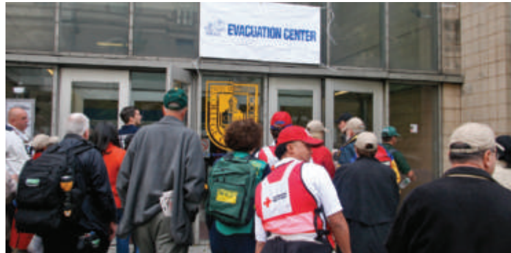
Mock evacuees arrive at an evacuation center during the 2006 HurrEx exercise.