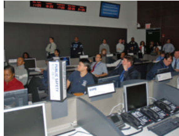
OEM staff and partners train for a winter weather emergency during SnowEx 2007.