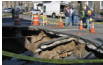
The Water Main Task Force responds to a large water main break.