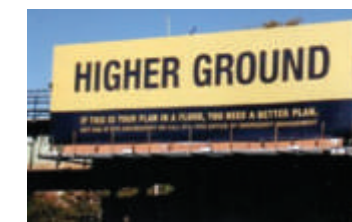
Ready New York billboards encourage residents to prepare for hurricanes.