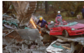
NY-TF 1 members extract mock victims from collapsed structures.