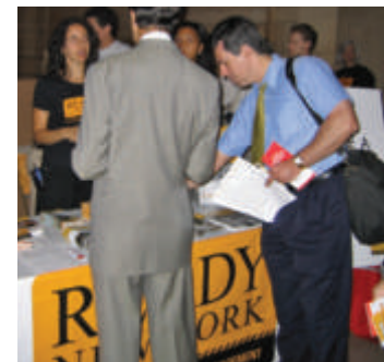
National Preparedness Month 2005 kicks off at Grand Central Terminal.

Since 2003, OEM has distributed 3.25 million emergency preparedness guides in up to 12 different languages.