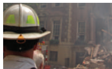
July 2006 building explosion and collapse