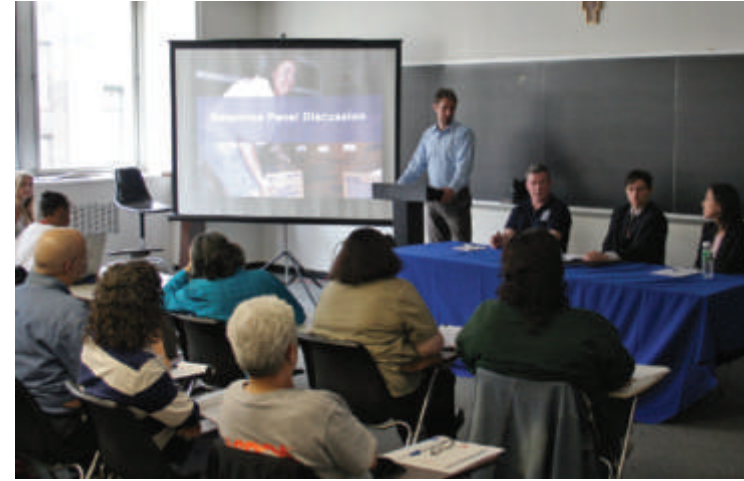
Volunteers attend a session at the Citizen Corps Council's Disaster Volunteer Conference in April 2007.

Coordinate emergency response and recovery