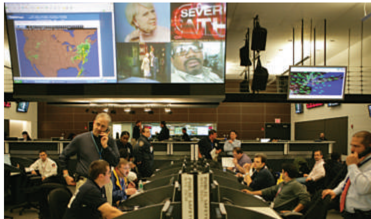
The City's new EOC can accommodate up to 130 public and private partners during an activation.