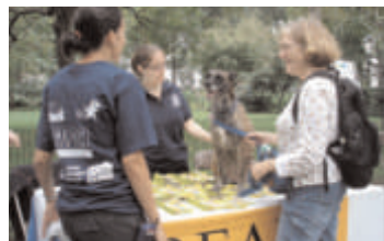
OEM staff distribute the Ready New York for Pets brochure at American Kennel Club's Responsible Dog Ownership Day in Madison Square Park.