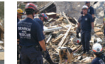
NY-TF 1 members search for survivors in Mississippi after Hurricane Katrina.