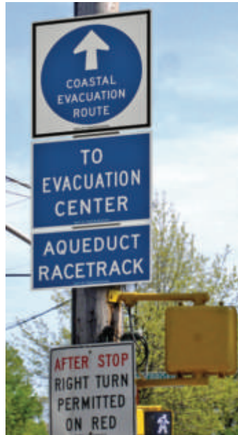
Coastal evacuation signs, which are posted throughout the five boroughs, direct traffic to evacuation centers.

In September 2006, to account for changes in the census data, OEM revised the Hurricane Evacuation Zone Finder, a web-based application, accessible through www.NYC.gov/oem or by calling 311, that determines if a user-specified address lies within any of the City's three hurricane evacuation zones. Residents who live in an evacuation zone may use the Finder to locate their closest evacuation center. The same application has been used to help city residents locate cooling centers during periods of extreme heat.