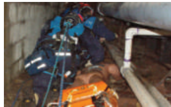
NY-TF 1 members navigate a tunnel as they search for trapped victims during a drill.