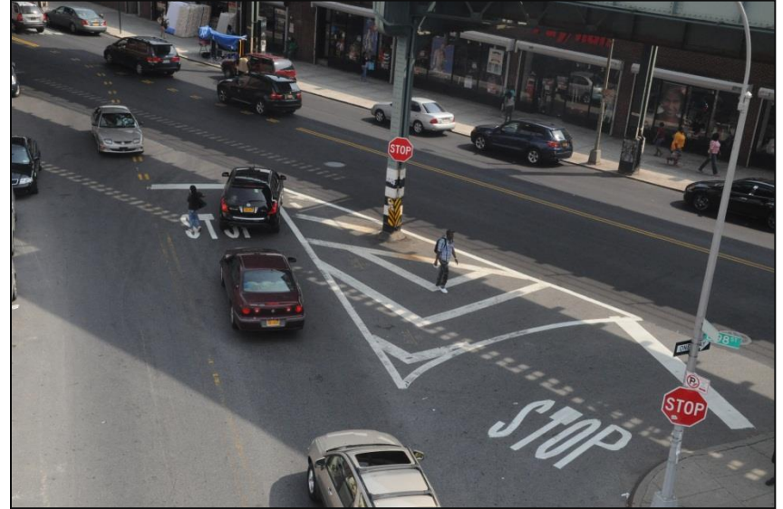
Before: Ralph Ave at E 98 th St