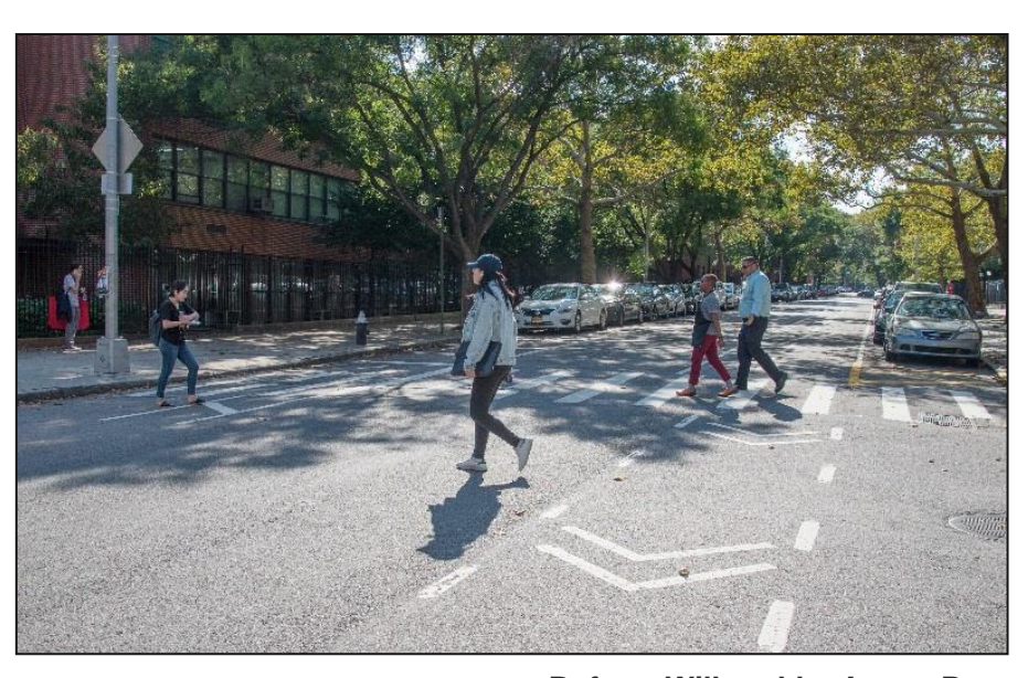
Before: Willoughby Ave at Pratt