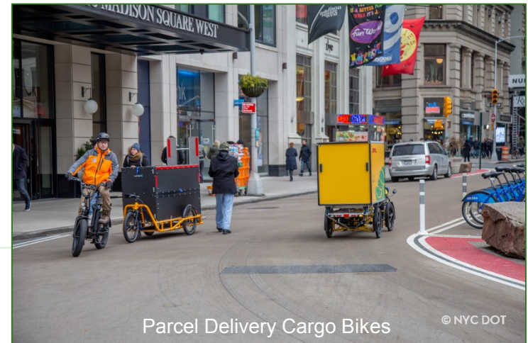
Parcel Delivery Cargo Bikes