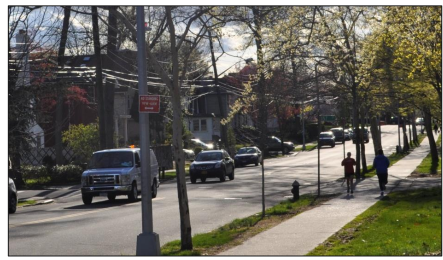
Before Conditions: 32<sup>nd</sup> Ave at Bowne Park