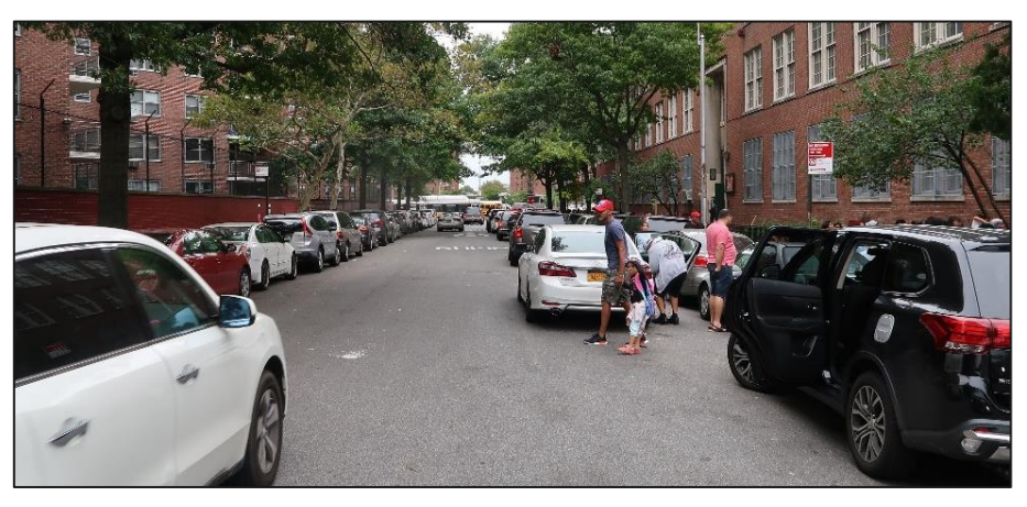
Before Conditions: 98th St