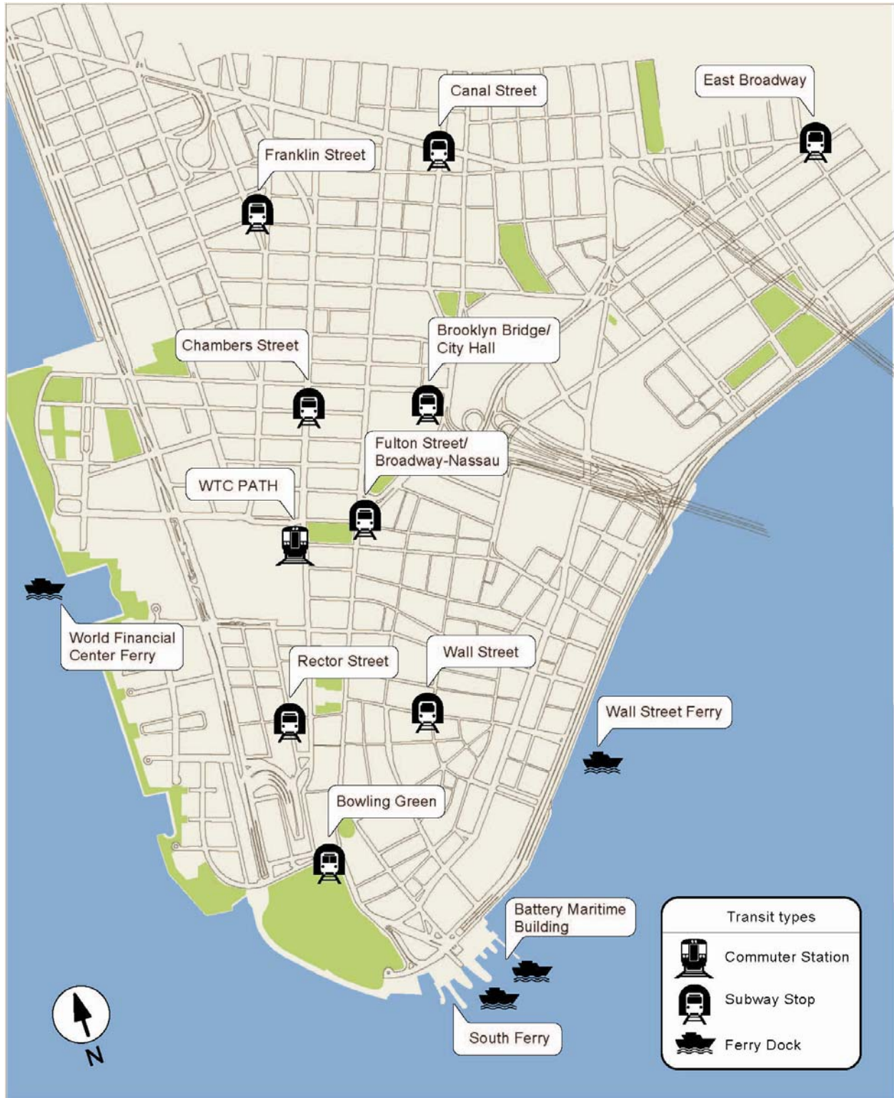
FIGURE 1 LM map with select transit stations