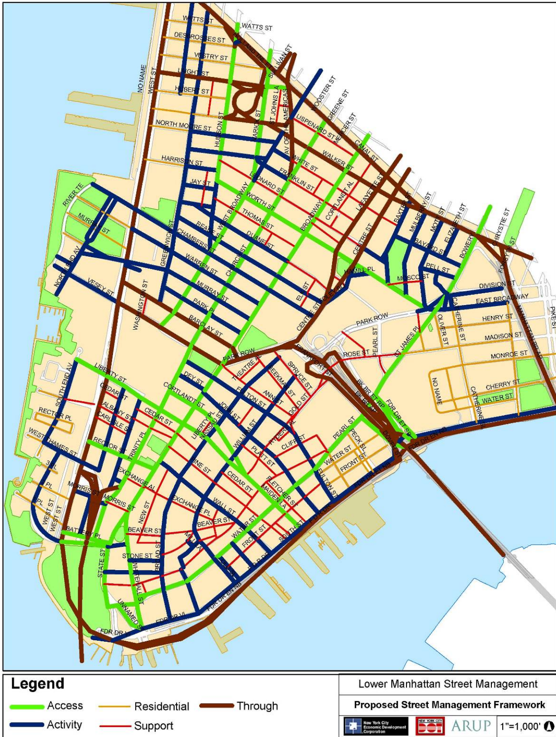
FIGURE 6 Proposed street management framework for LM.