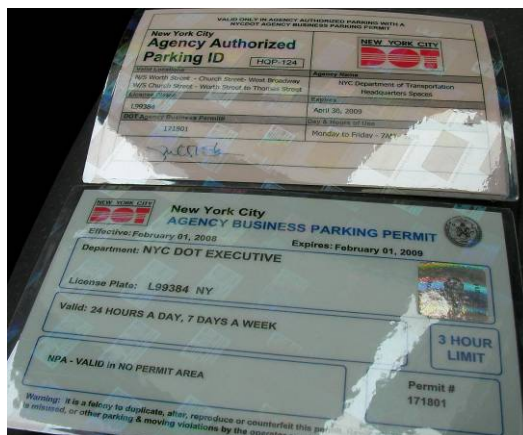
FIGURE 3 Example of a placard in LM.

To quantify problem, the Team surveyed and analyzed on-street parking south of Canal Street. Additionally, a second goal of the study was to gather data to support future planning and policy decisions. Initially, to understand parking supply, a base map of existing parking spaces and corresponding regulations was developed using NYCDOT's STATUS application, a comprehensive database of all city curb regulations. To understand parking demand, a survey was conducted from September 19 th – November 15 th , 2006 and entailed the survey of every blockface over two consecutive days between 7am – 9pm. Detailed data was collected on every parked or double-parked vehicle.