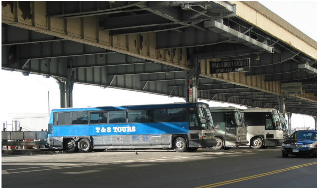
FIGURE 5 Existing bus layover/storage on South Street under the FDR Drive.

that is a long-term solution. An interim solution is critical. The methodology for finding these locations should be incorporated into the greater street management framework such that a balance can be achieved between bus layover areas, the public realm, the environment for pedestrians and bicyclists, commercial needs, and general traffic operations.