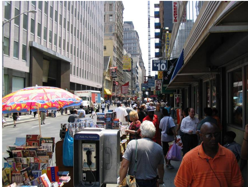
FIGURE 2 Example of crowded sidewalks in LM

whose capacity is needed for mobility in peak hours can be used for commercial loading, or resident parking during off-peak periods.