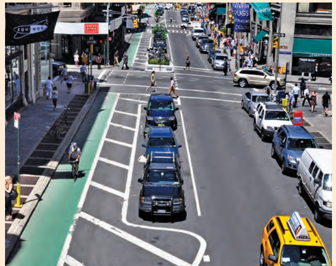
A parking protected bicycle path and landscaped, pedestrian safety islands were added along Broadway between 23rd Street and 18th Street.