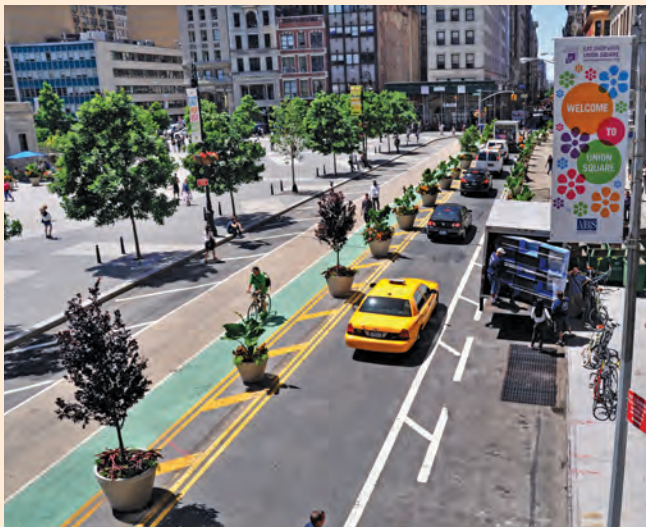
17th Street between Union Square West and Park Avenue South was converted from two-way to one-way westbound. New sidewalk connections, a bike lane and farmers' market parking were added to improve safety, mobility and curb-side access.

Improvements were also made to crosstown streets in the project area to ensure they would be able to handle diverted southbound Broadway traffic and to reduce congestion that pre-dated this project. These improvements included curb-side turn-lanes and modified parking regulations. Turn restrictions were implemented at various locations in the project area including left-turns off Park Avenue South to increase mobility and a new forced right-turn off of southbound Union Square West at East 14th Street eliminating a head-on condition.