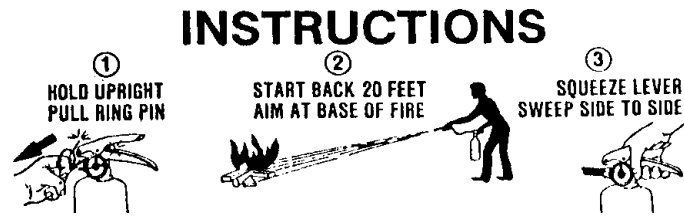
Operation Instructions for a Fire Extinguisher

Generally, operation instructions are clearly painted on the side of the fire extinguisher. They clearly describe how to use the extinguisher in case of an emergency. Examples of these instructions are shown below.