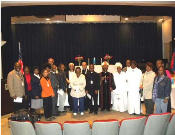
Department of Pastoral Care and attendees of the Interfaith Service of Comfort

On Tuesday, May 18, 2010, Haitian Flag Day, the Department of Pastoral Care warmed the hearts of attendees at the Interfaith Service of Comfort for our Haitian Sisters and Brothers in the Herbert G. Cave Auditorium. The special service was celebrated in English, French and Creole. Prayers, scriptures, songs and words of comfort filled the auditorium, lifting spirits, providing support and assurance that together we can all overcome times of despair.