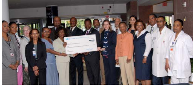
Representatives of HHC and the Mayor's Office presenting the Haiti Relief Check.

Download the registration form at: http://nyc.gov/html/hhc/downloads/pdf/uhc-2010-registration.pdf . Register early because seating is limited. If you have questions, please email urbanhealth@nychhc.org .