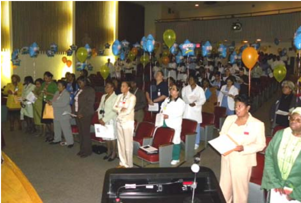
Nurses Week Main Event

Harlem Hospital Center-Generations+/Northern Manhattan Network May 28, 2010-----