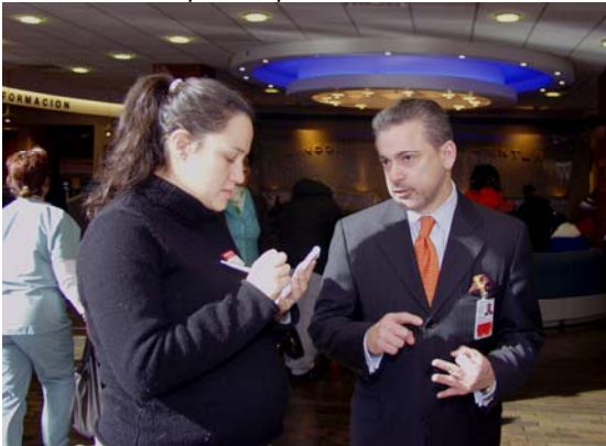
Hispanic Magazine reporter March 2007