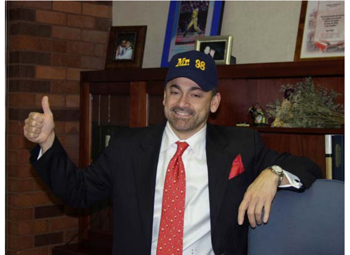
Hat gives the joint commission score 2006 (98%)