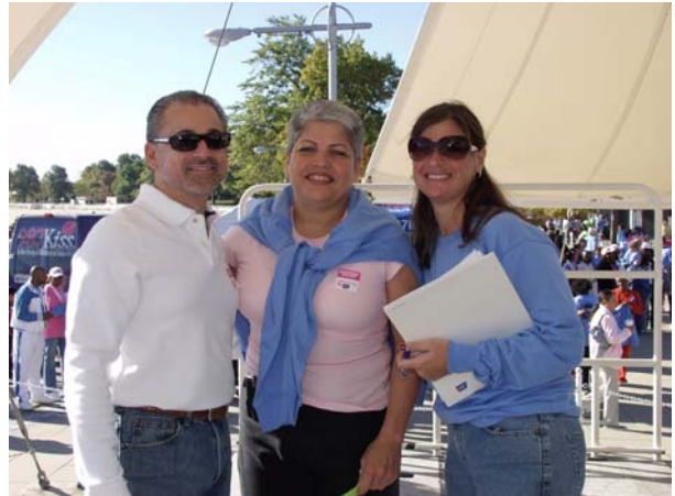
Making Strides Against Breast Cancer, 2007