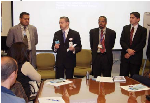
Medical Research Assistants Program 2007