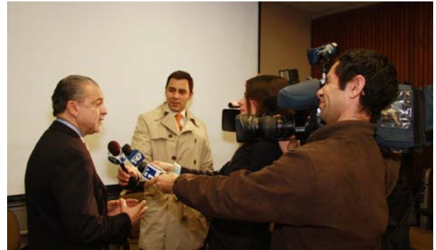
November 2009 Press Conference