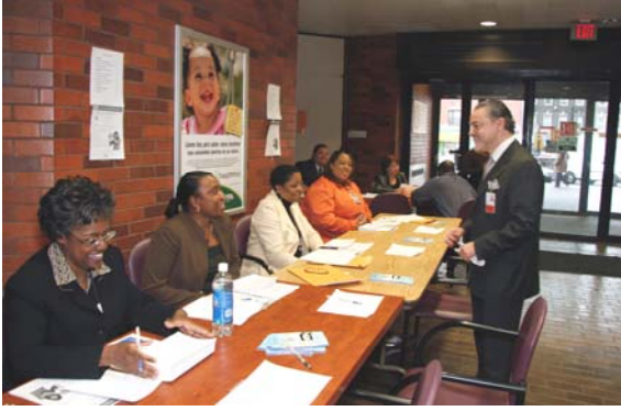
Tribute to Harlem staff at Lincoln