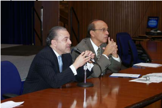
Improving NYC for the Elderly 2008