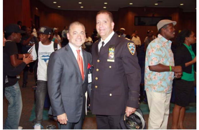
Bronx Commander at Mayor's meeting