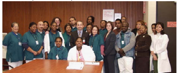
Dietary Recognition 2008