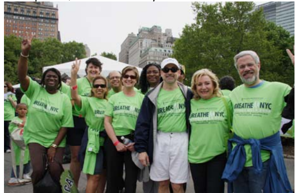
Asthma Walk 2008