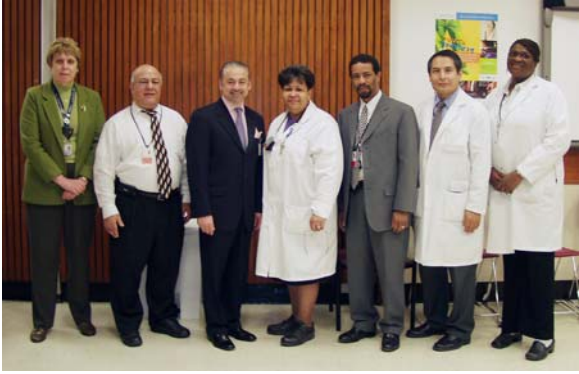
Asthma Kick Off 2008