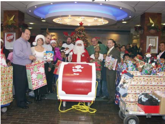
Christmas at Lincoln 2007