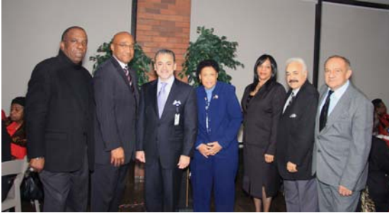
CAB and Auxiliary Holiday Dinner, December 2008