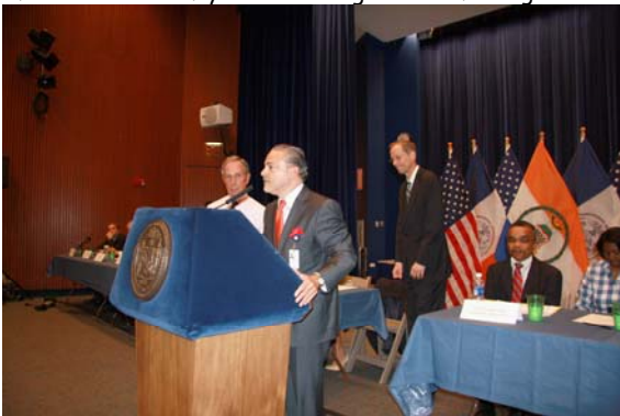
Responding to question from the audience