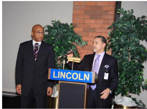
CAB and Auxiliary Christmas 2008