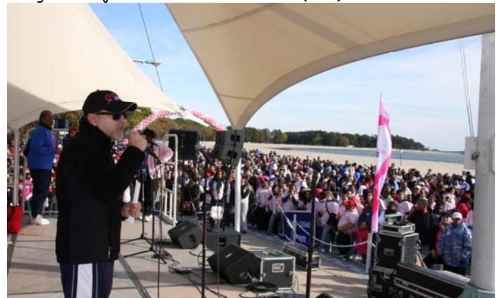
Orchard Beach 2006