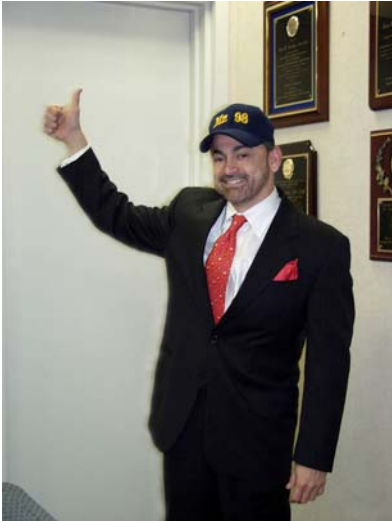
Last day of a joint commission survey