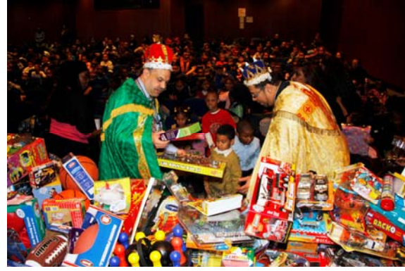
Three Kings Day at Lincoln in 2009