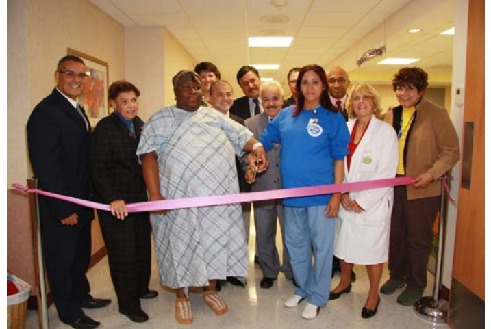
September L&D Ribbon Cutting 2009