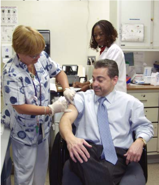
Flu shot circa 2005