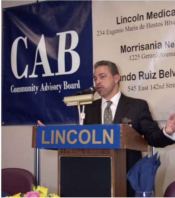
CAB Legislative Summit 2007