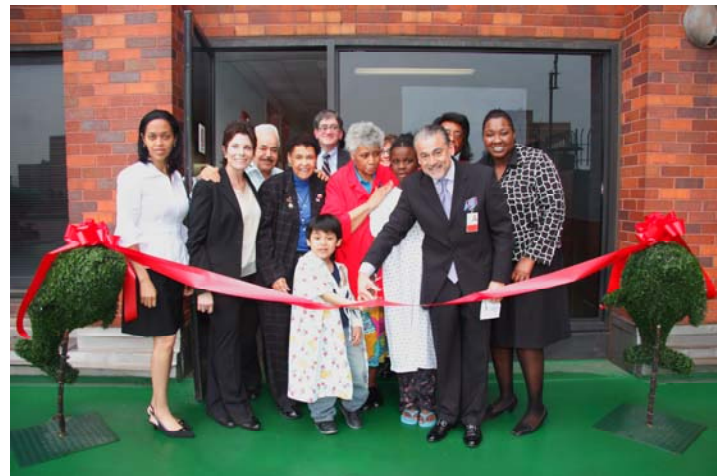
Rooftop Garden Ribbon Cutting