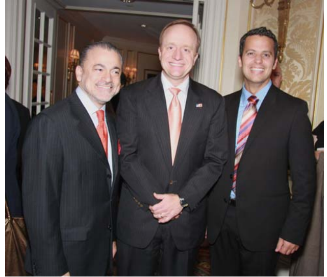
Urban Health Conference June 2009