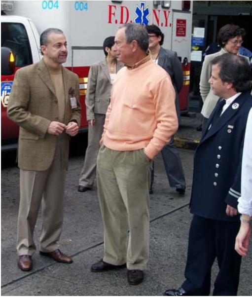
Thanksgiving with the Mayor 2006