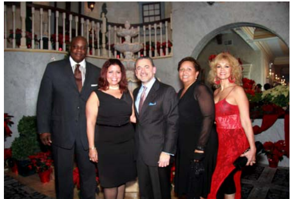
Christmas, Villa Barone, December 2008