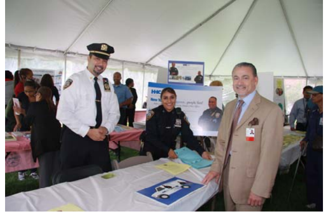
Career Day 2009