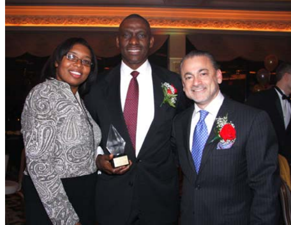
171 st Anniversary, Marina del Rey, October 2009