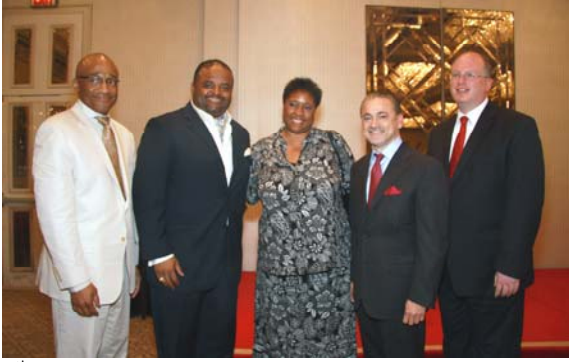
9 th Annual Urban Health Conference (2010)