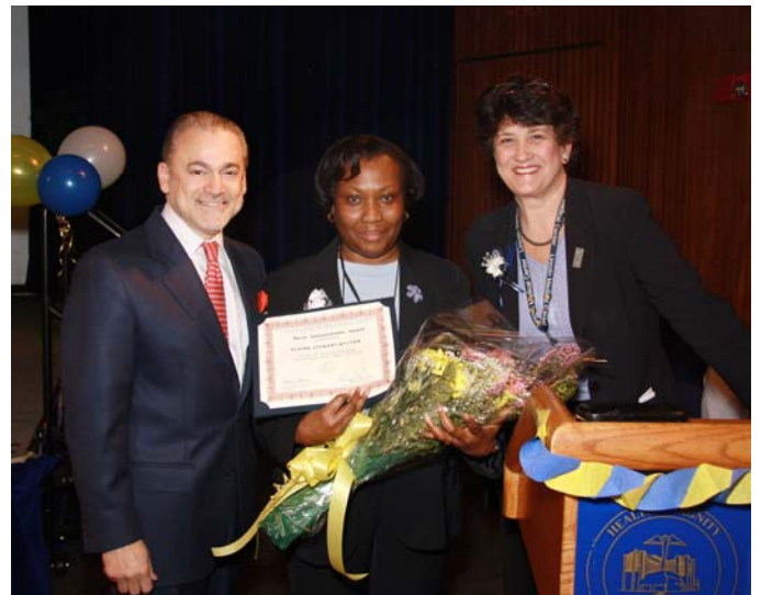
2010 Nurses Recognition Ceremony