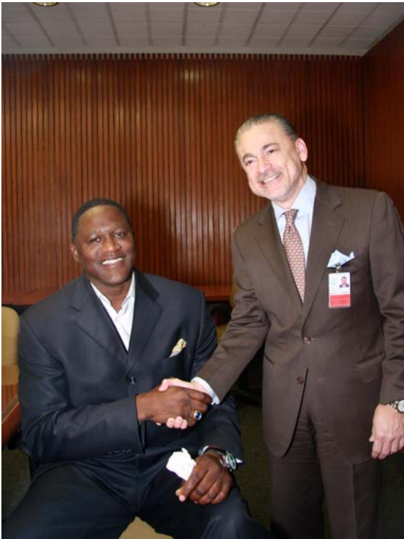
NBA star, Dominic Wilkins