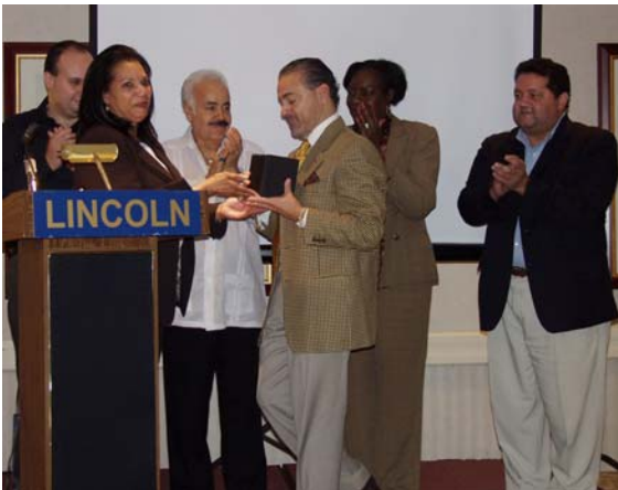
Network CAB Retreat 2007