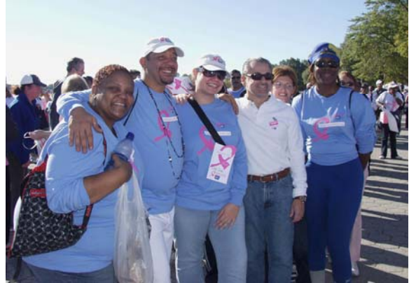
Making Strides 2007