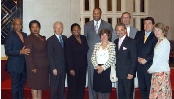
Urban Health Conference CEO group, 2007