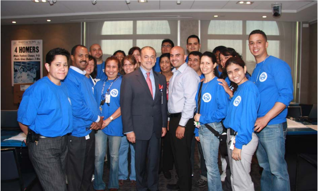
Yankee Stadium, 4 th Annual Back to School Immunization Campaign staff, August 2010