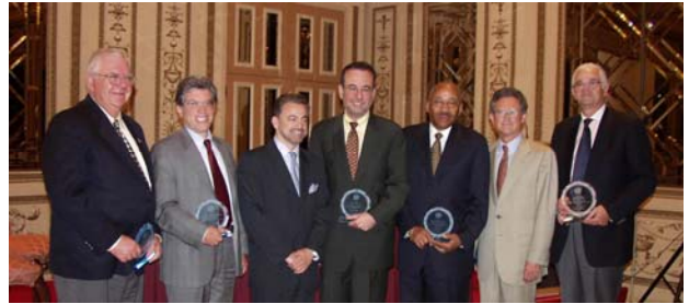
Former HHC Presidents, Urban Health Conference 2005