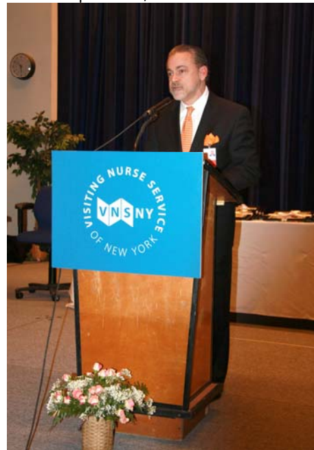
January 2009, Visiting Nurse Services of NY