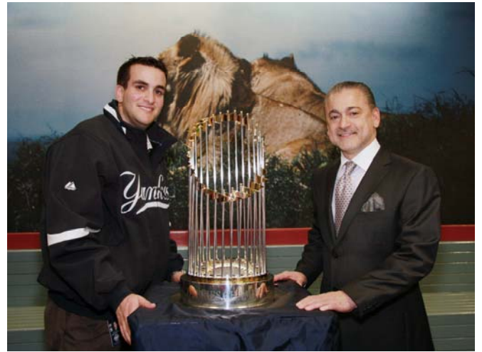
Yankees display the World Series Trophy at Lincoln