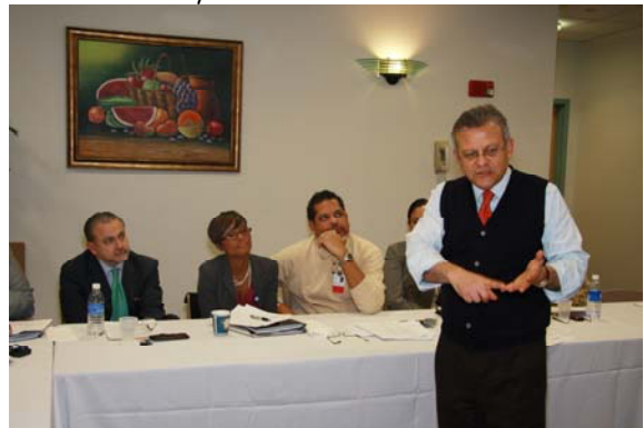
Community Partnership Initiative 2008