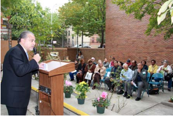
Belvis Ribbon Cutting, Oct 2009