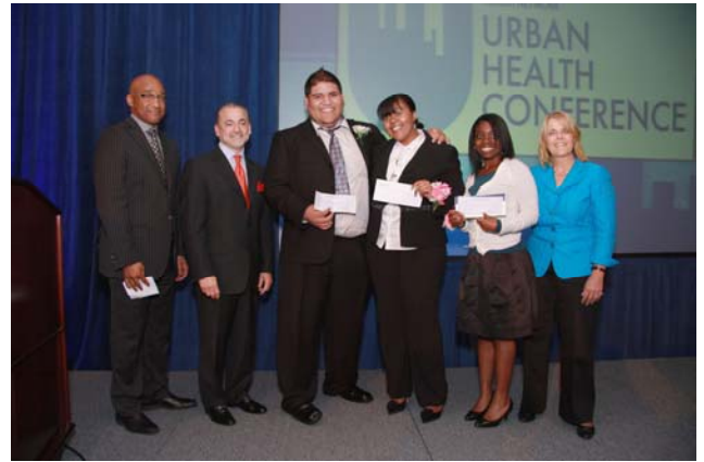
Scholarship winners, UHC