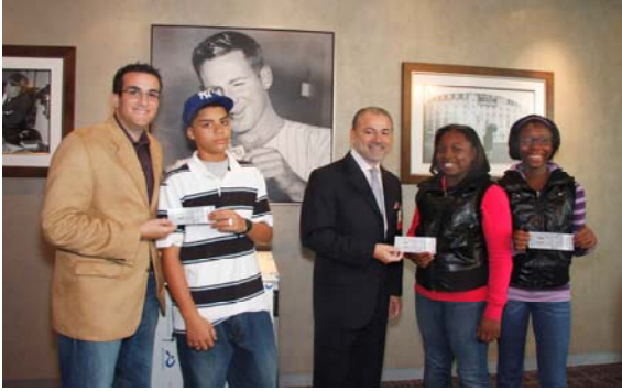
Yankee tickets 2009 at the new Yankee Stadium