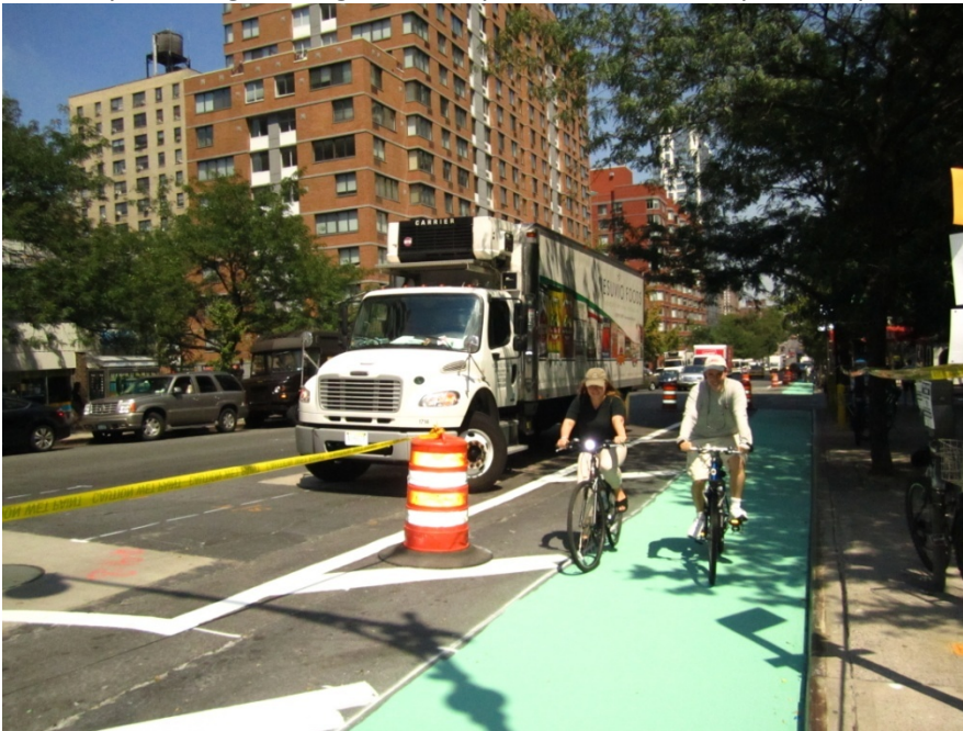
Columbus Ave, facing north between West 95 th and West 94 th Streets