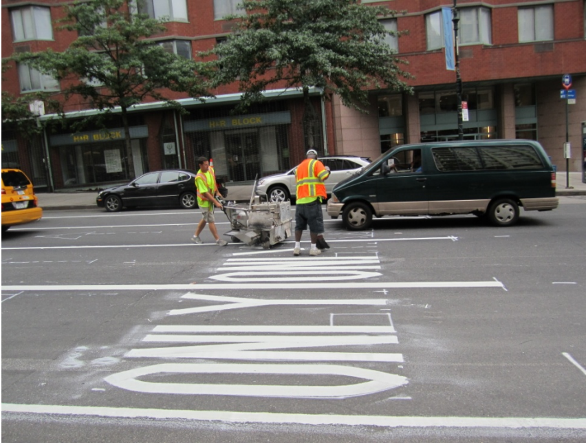
Columbus Ave, between West 97 th and West 96 th Streets