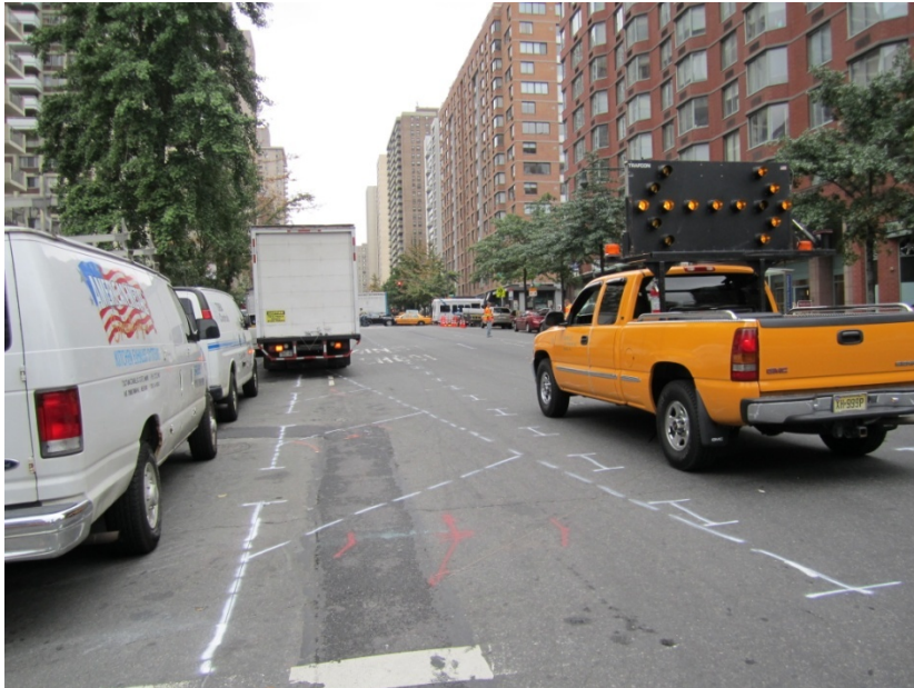
Columbus Ave, facing south from West 97 th Street