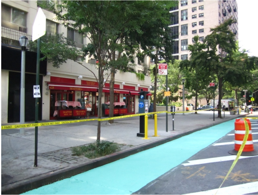
Columbus Ave, facing south between West 91 st and West 90 th Streets