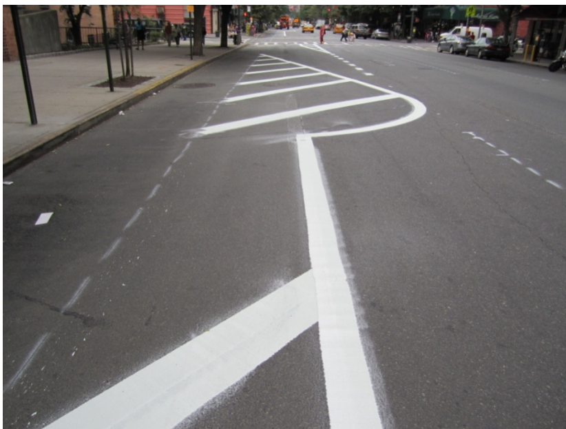
Columbus Ave facing south towards West 88 h Street