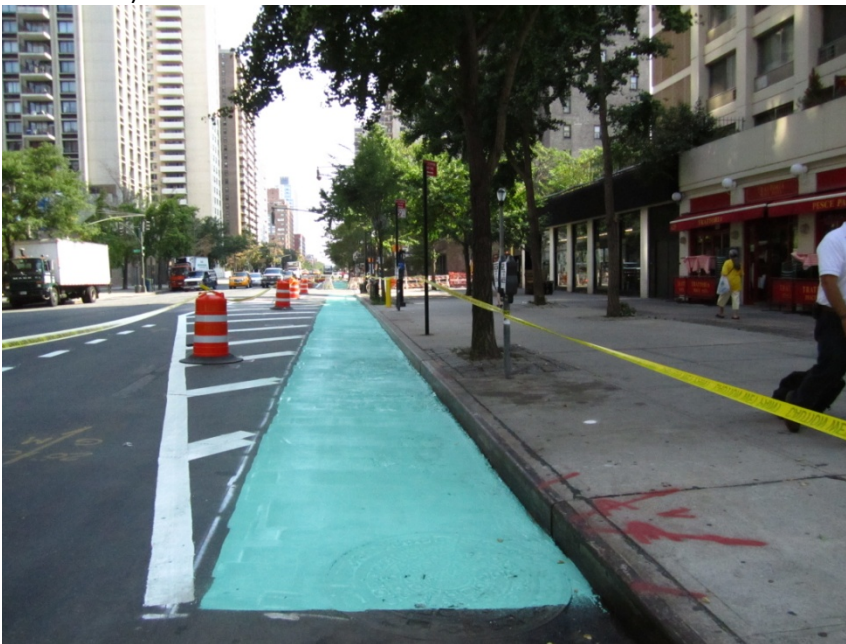
Columbus Ave, facing north from West 90 th Street