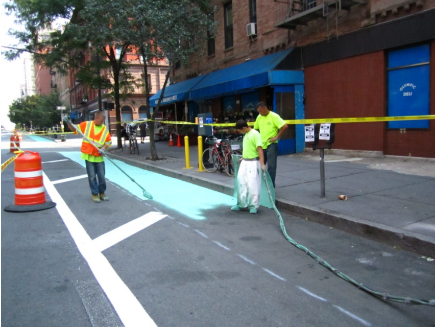
Columbus Ave, facing north towards West 87 th Street