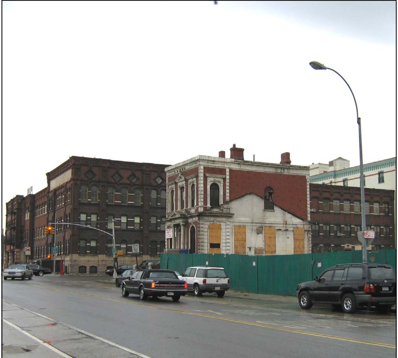
New York and Long Island Coignet Stone Company Building View from Third Street, west façade