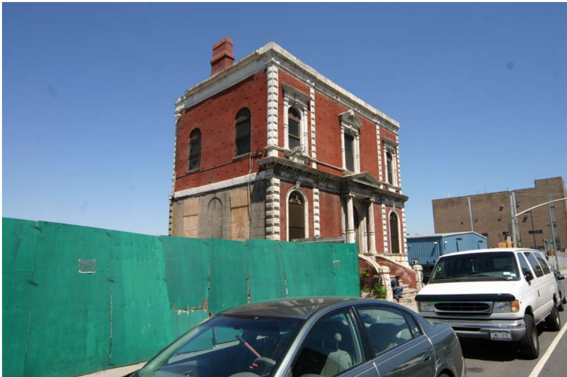
New York and Long Island Coignet Stone Company Building Third Avenue façade: center of second story View from south toward 3rd Street