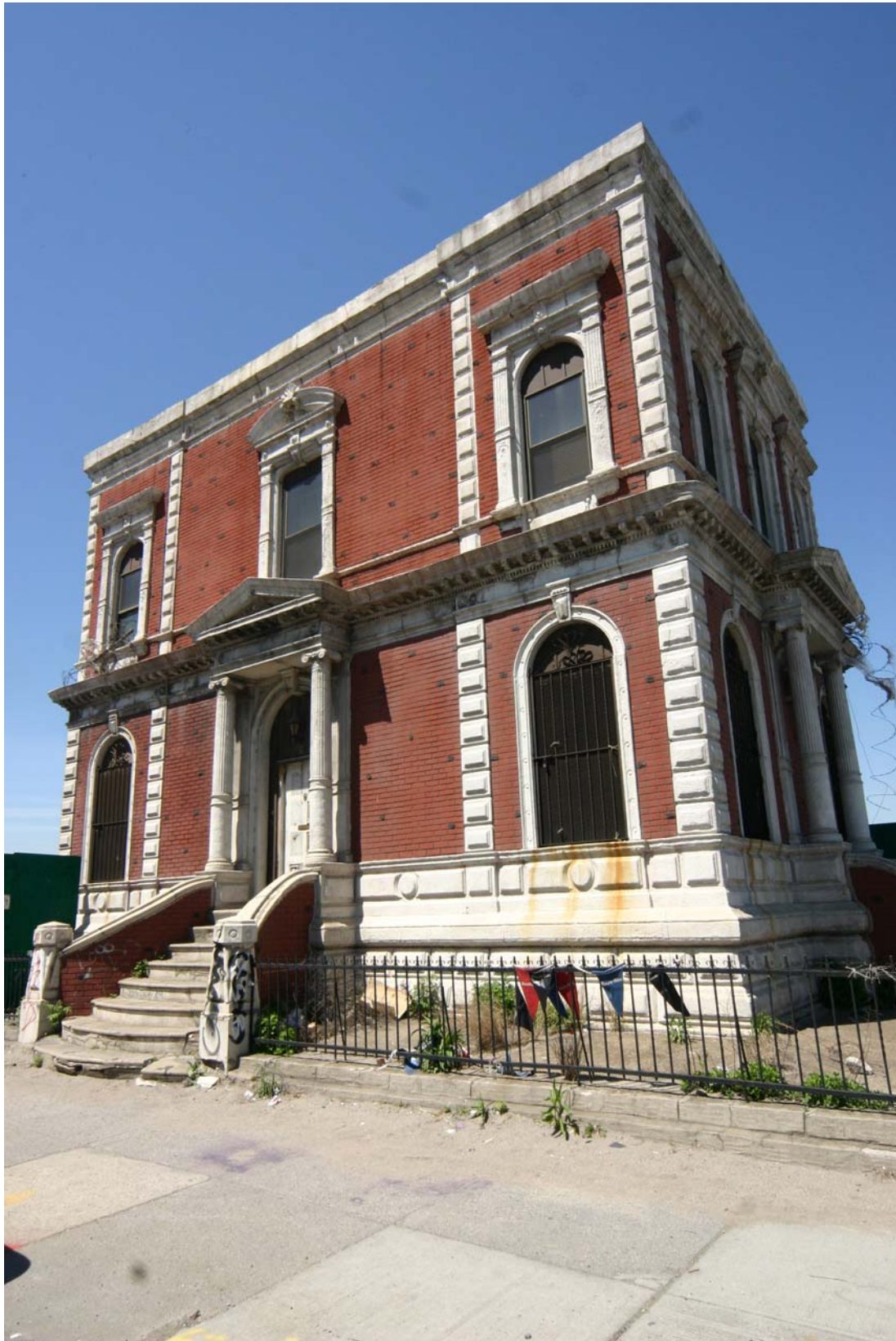
New York and Long Island Coignet Stone Company Building Third Avenue facade