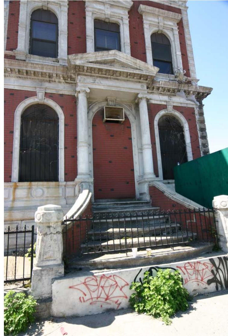
New York and Long Island Coignet Stone Company Building Third Avenue stairs and Third Street stairs