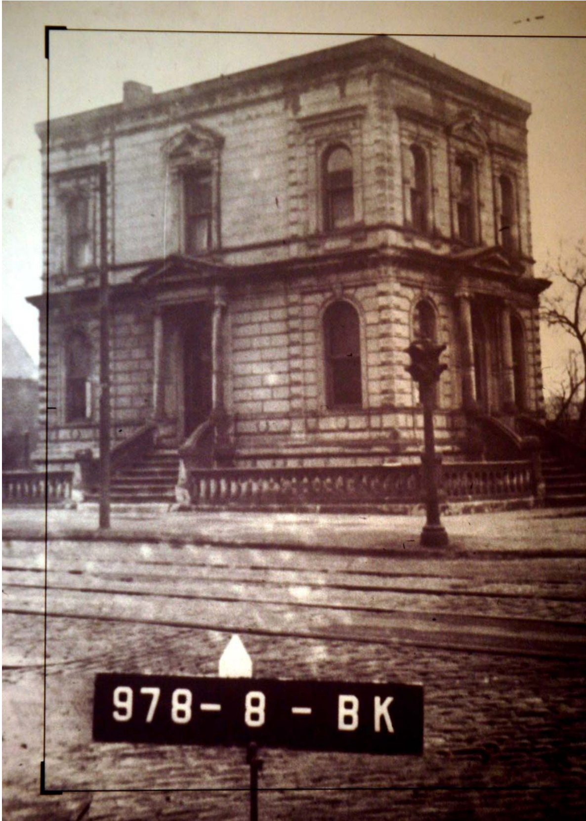
New York and Long Island Coignet Stone Company Building 360 Third Avenue, Brooklyn