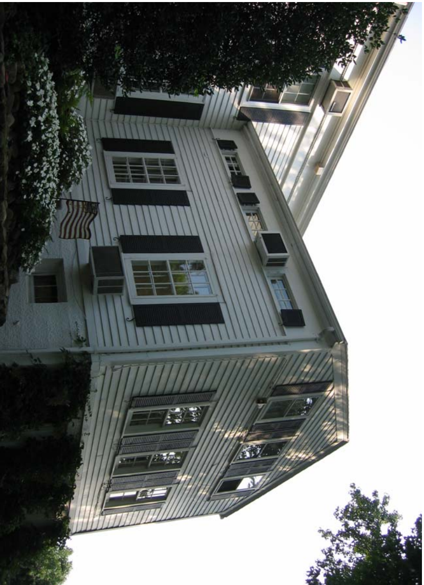
Historic wing from the southwest