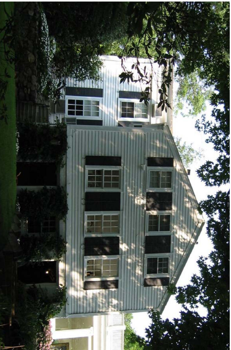
Historic wing, south façade