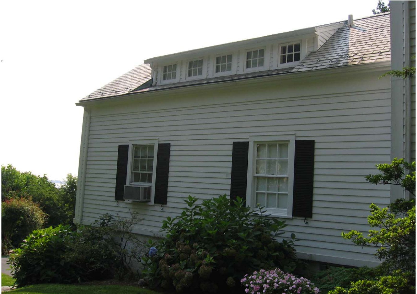
Historic ell of the Gillett-Tyler House, north façade