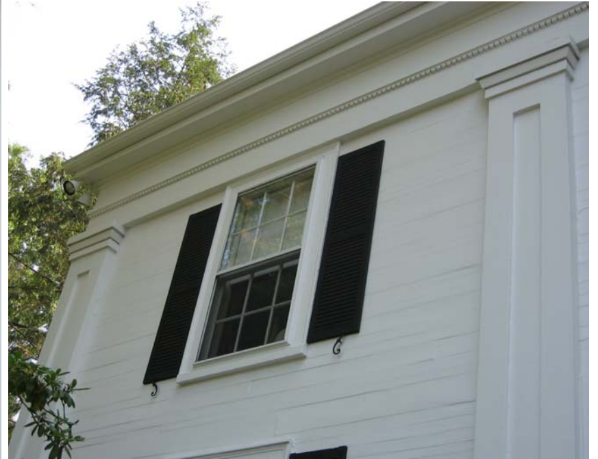
Window and trim detail