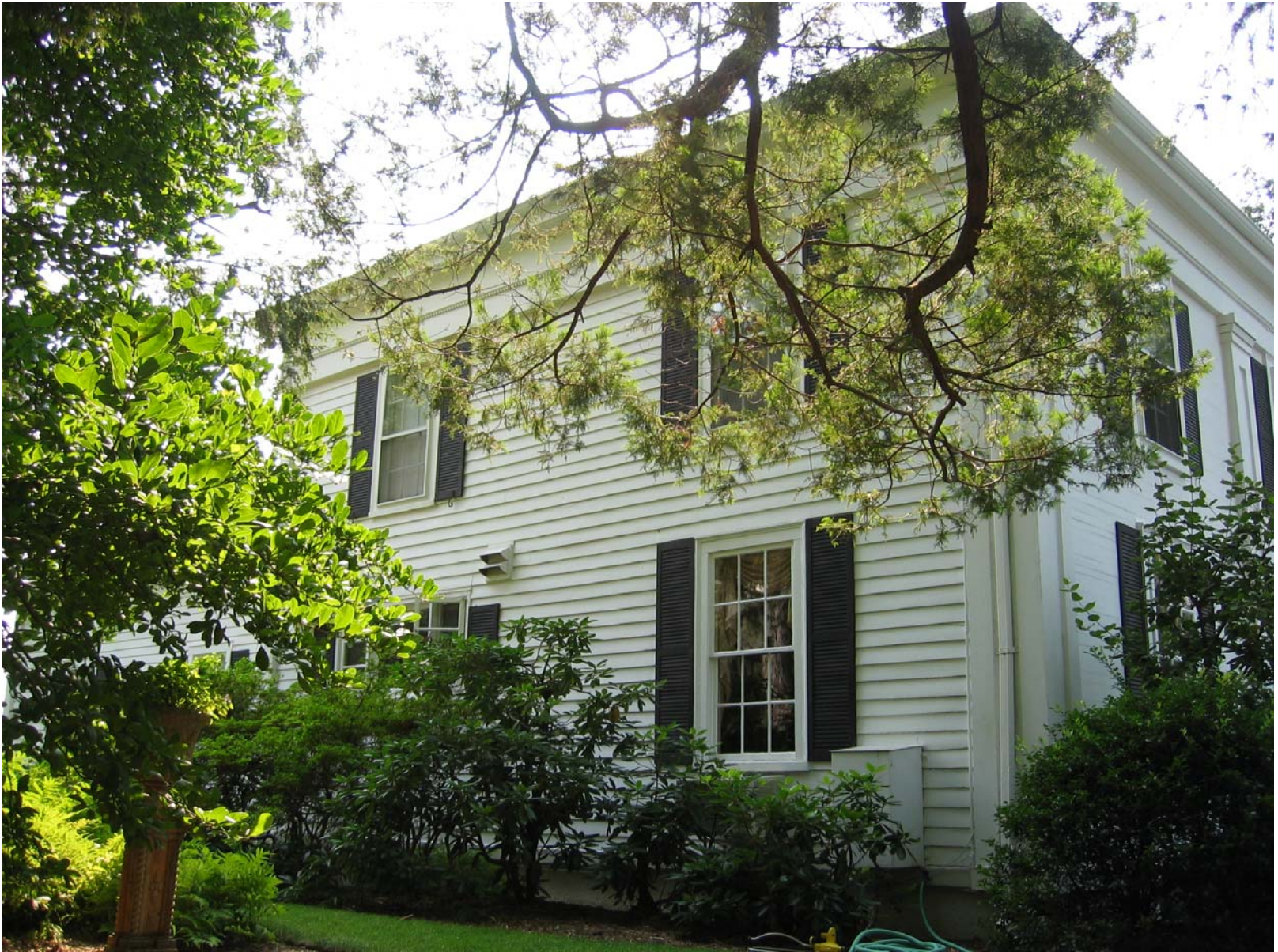
Gillett-Tyler House, north façade