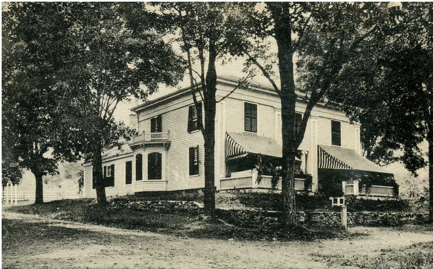
The Gillett Residence, Enfield, Mass.

Photo postcard of the Gillett Residence, while it was still located in Enfield, Massachusetts (dated 1905-10).