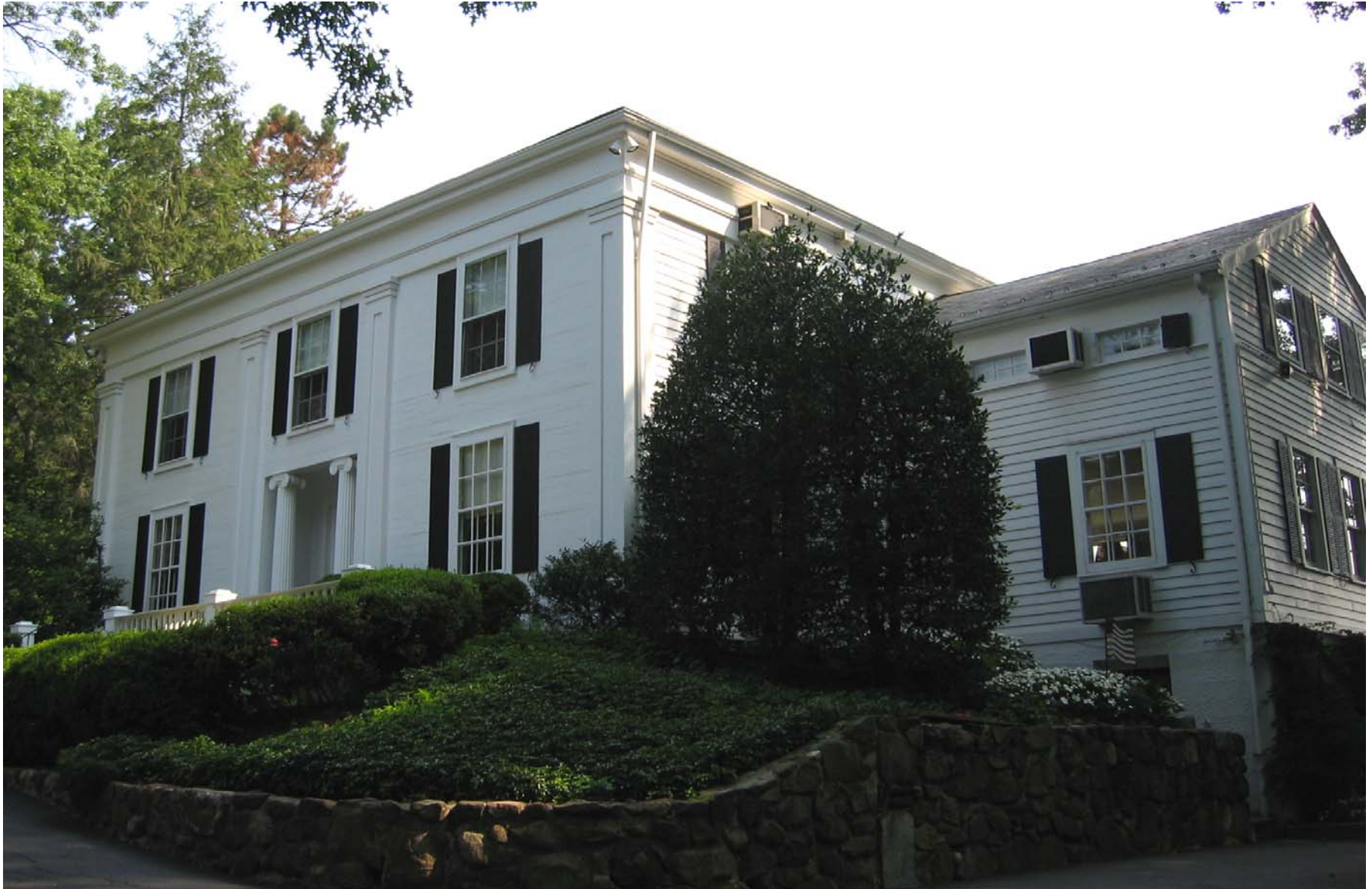
Gillett-Tyler House