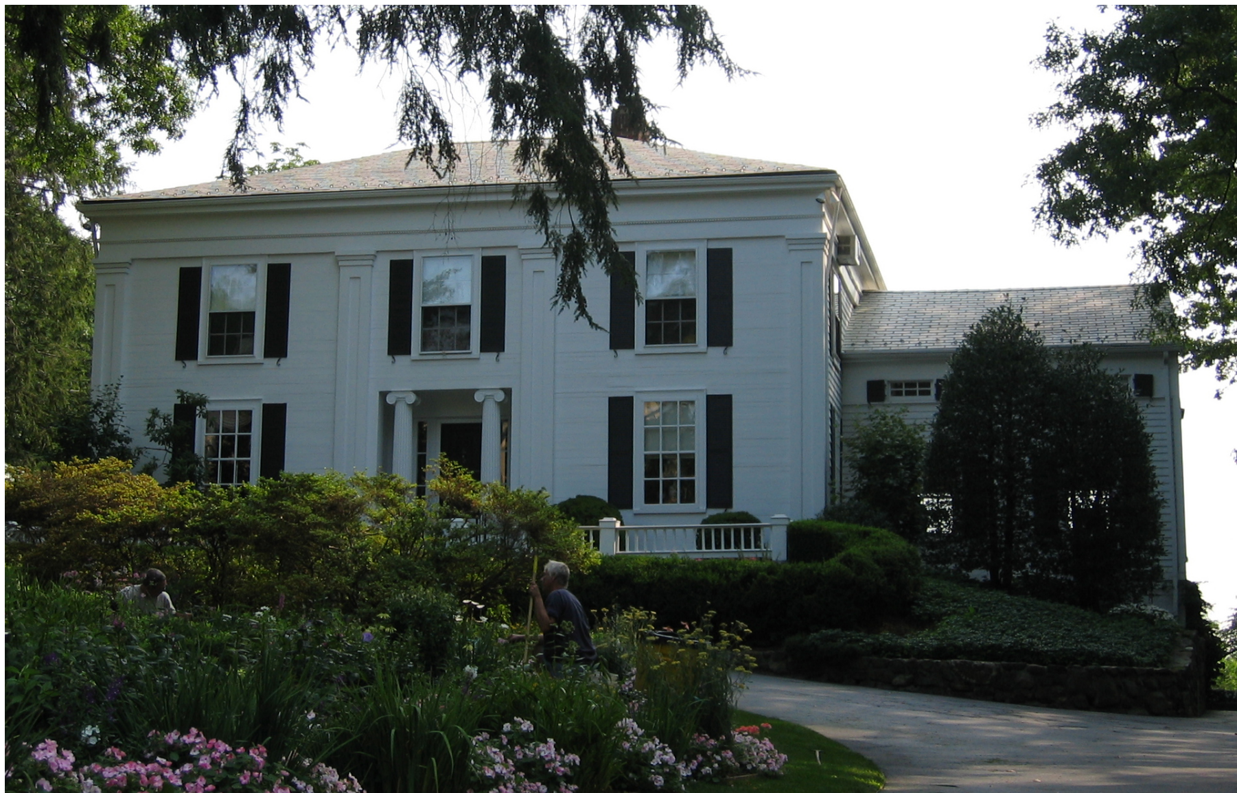
Gillett-Tyler House, 103 Circle Road, Staten Island