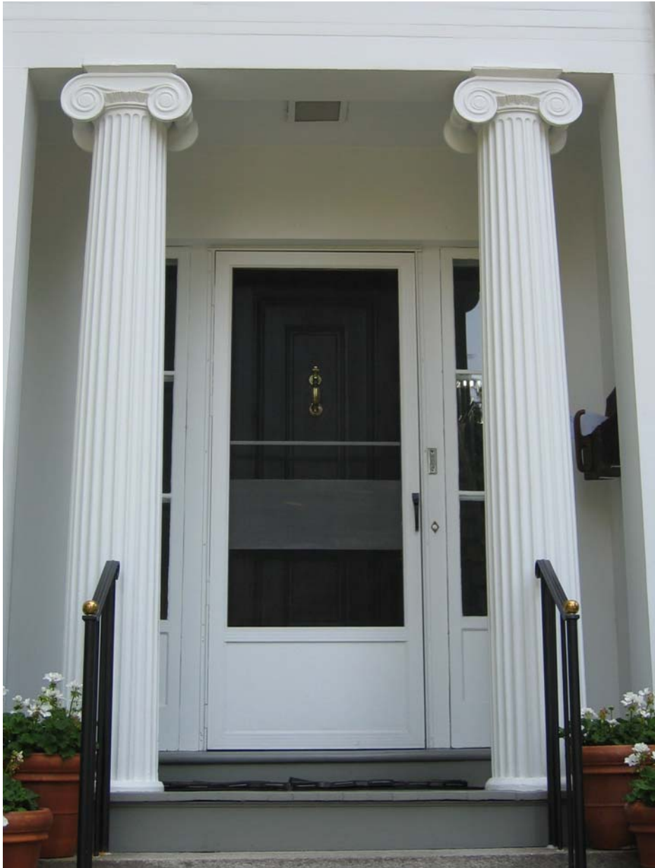
Gillett-Tyler House entry