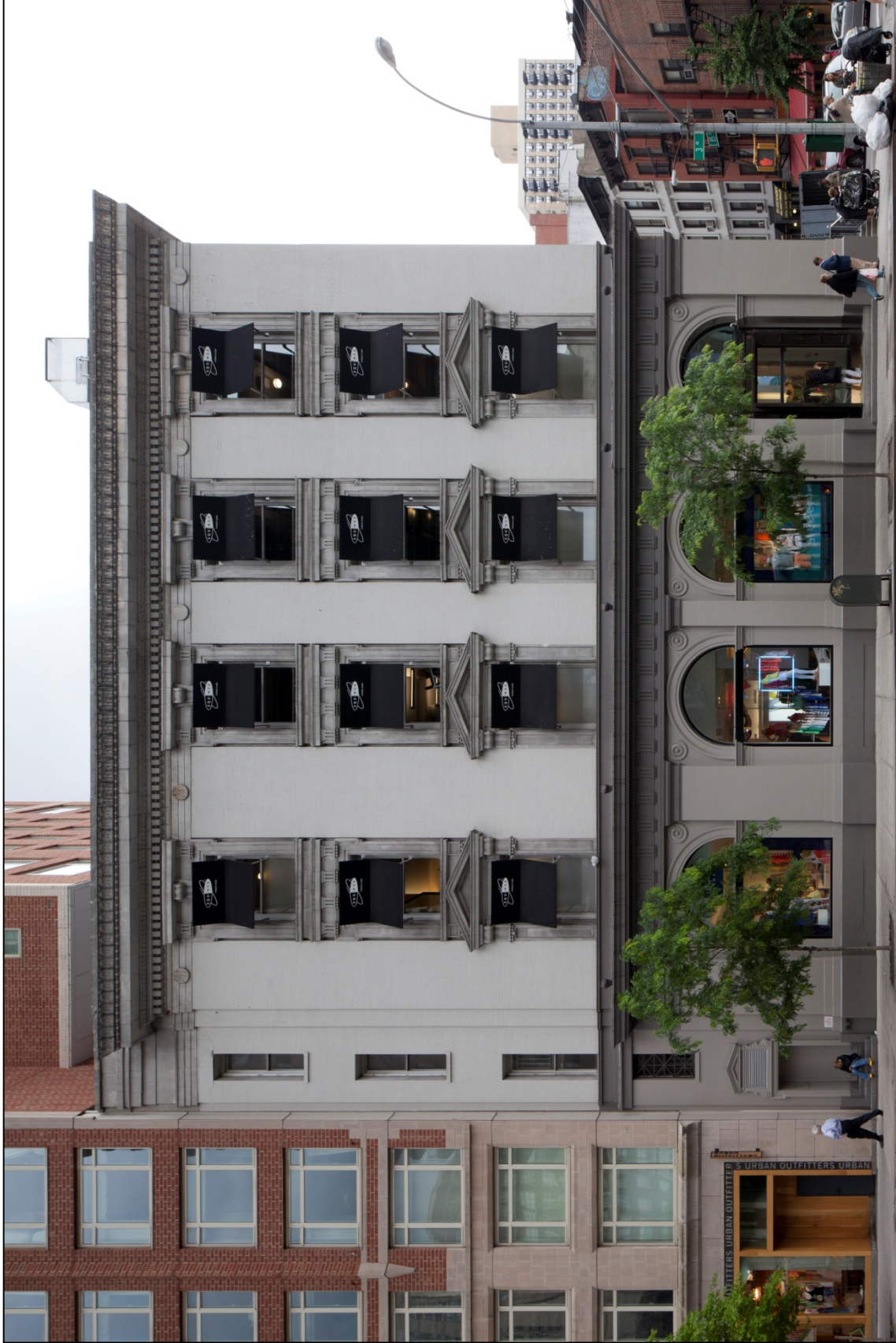
Yorkville Bank