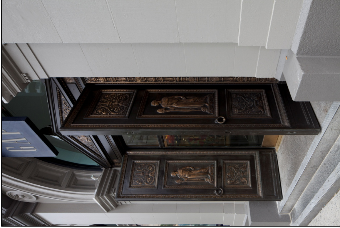
Cast-bronze doors fabricated by the John Polachek Bronze & Iron Co. of Long Island City