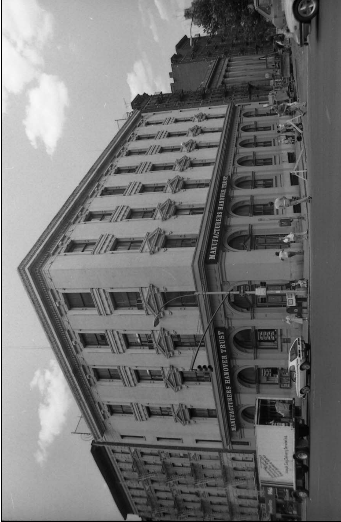
Yorkville Bank, Photo: Landmarks Preservation Commission staff, 1983