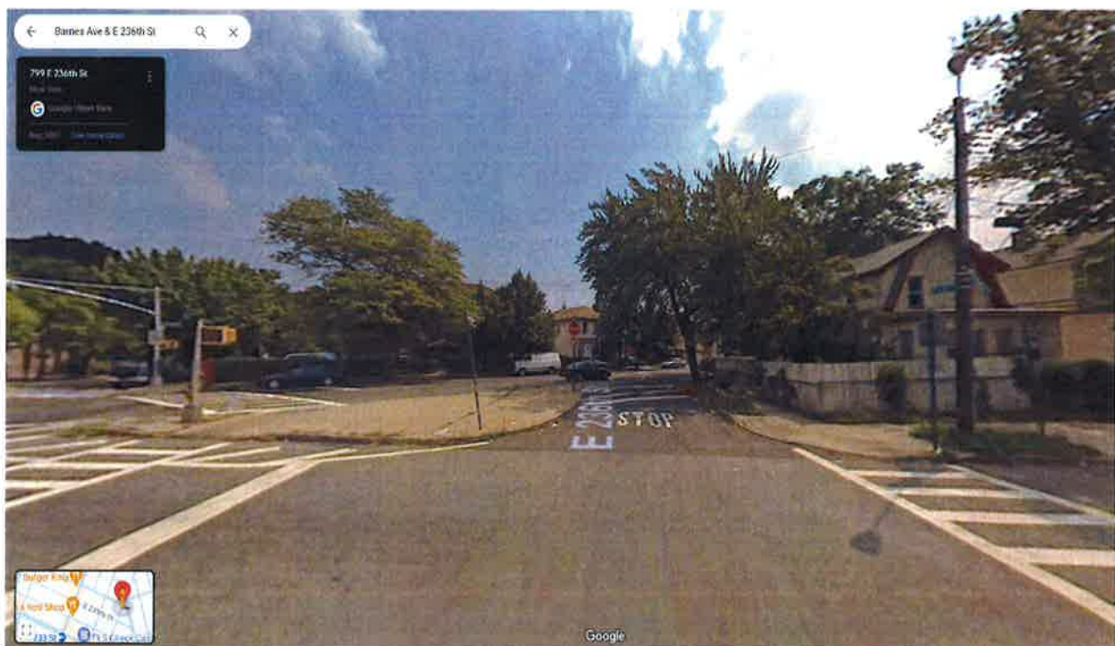
236th Street and Barnes