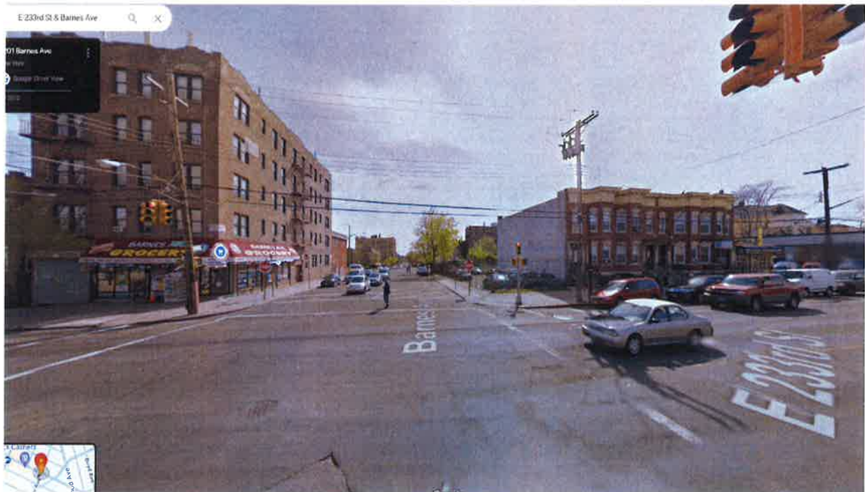
233rd Street and Barnes

traffic. One suggestion brought forth by the committee is to install no parking signs on both sides of the street between 233 and 232 Street. Also relocating the food truck further along Carpenter Avenue to eliminate the bottle neck it creates.