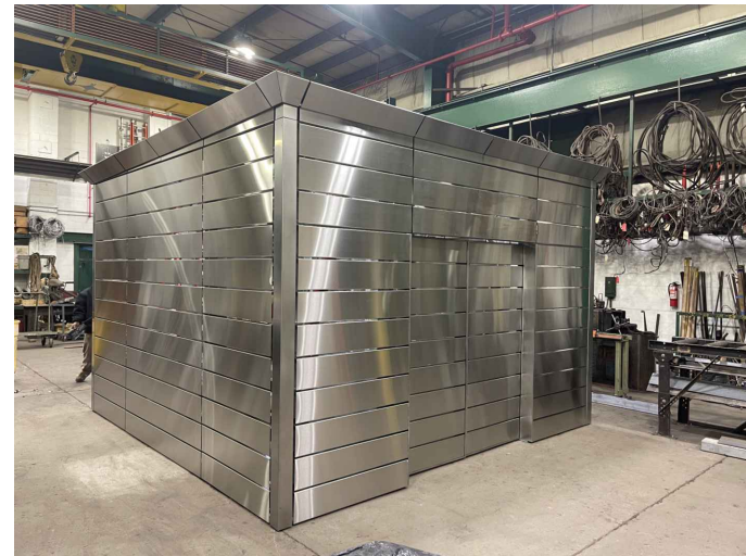
CONCEPT PHOTO FOR REFERENCE