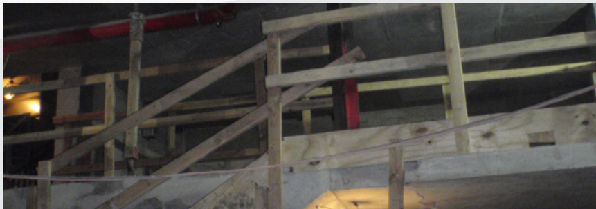
Hand Rail Protection