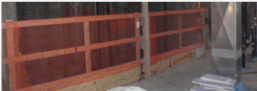
Shaftway Opening Protection

Be aware of your surroundings, especially around edges, shafts and floor openings. And never work near an open floor or open shaft without proper fall protection.