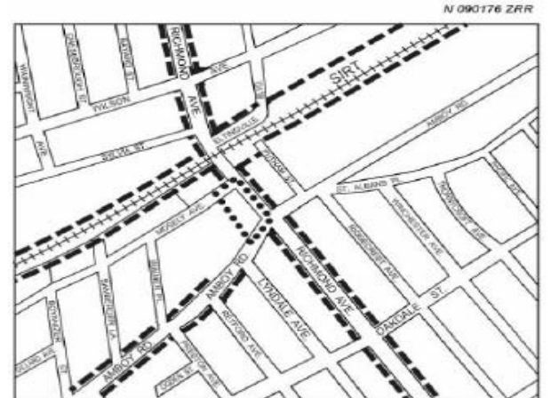
DIAGRAM SHOWING PROPOSED CHANGE IN ARTERIAL SETBACK SHOWN ON SOUTH RICHMOND SPECIAL DISTRICT PLAN ON SECTIONAL MAP 33c, BOROUGH OF STATEN ISLAND. SCALE: 1"=100'

The Zoning Resolution of the City of New York, effective as of December 15, 1961, and as subsequently amended, is further amended as follows: