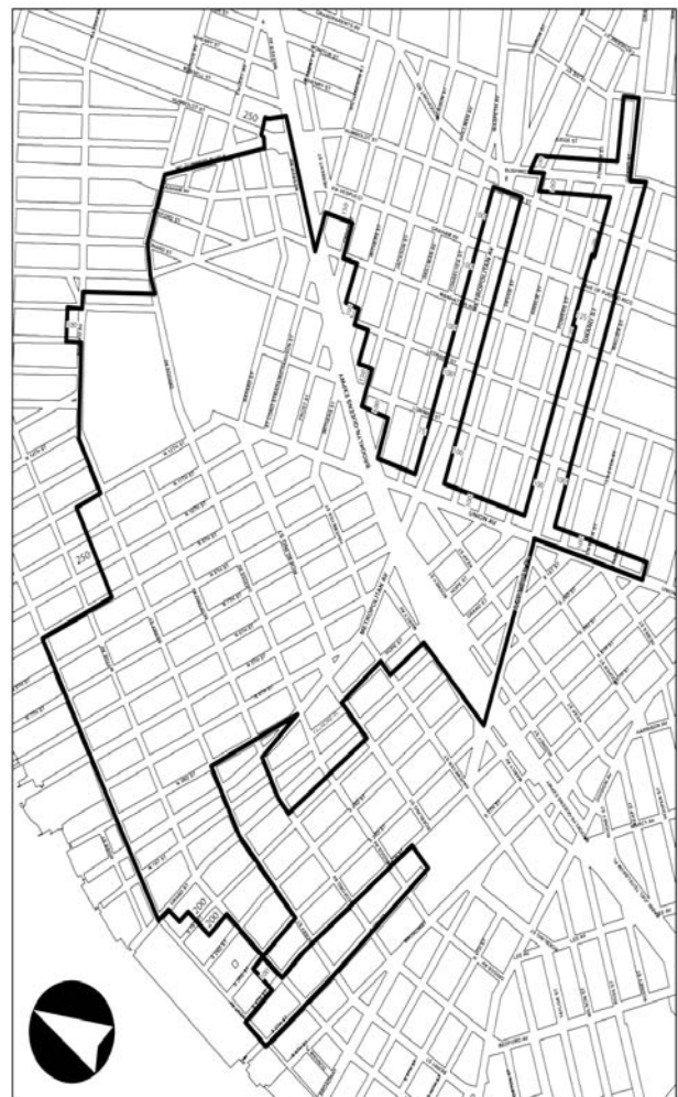
EXISTING Portion of Community District 1, Brooklyn