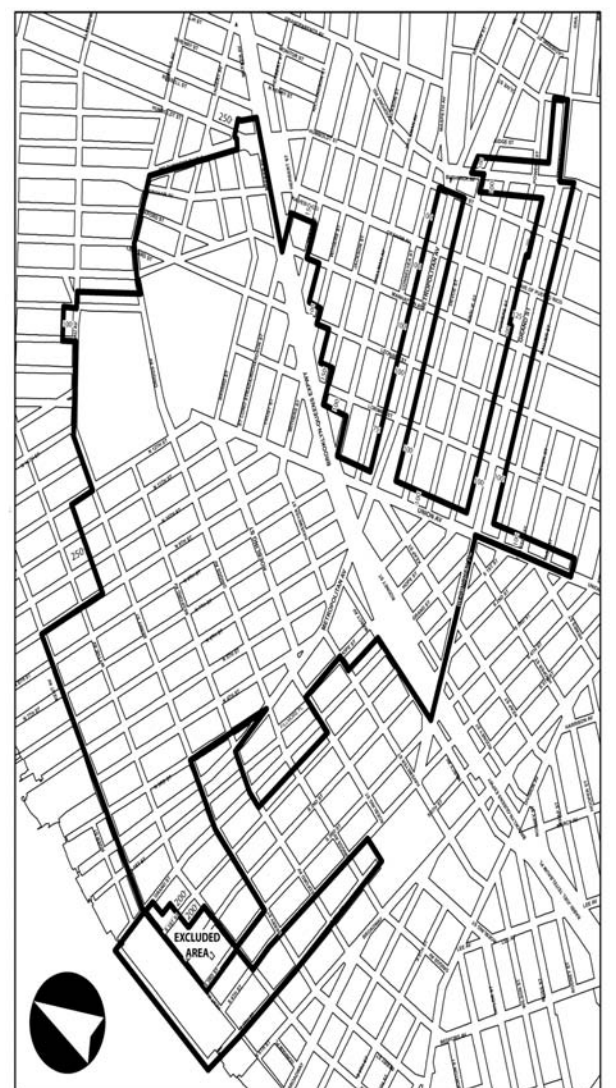
PROPOSED Portion of Community District 1, Brooklyn