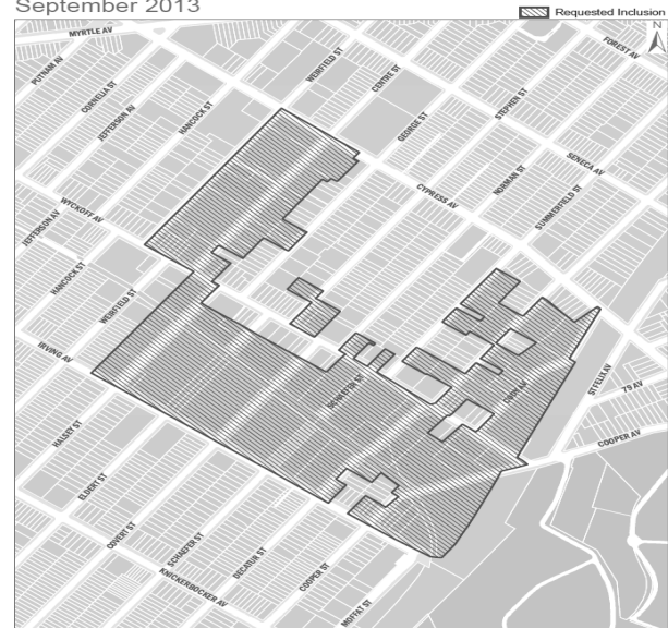
Data Source: MapPLUTO copyrighted by the New York City Department of City Planning Prepared by New York City Economic Development Corporation (MGS Unit) 08/12/2013