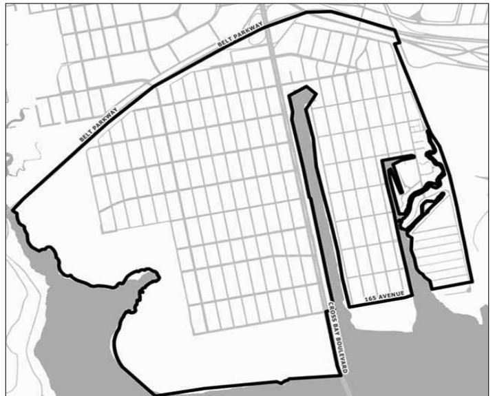
Map 4 Neighborhood Recovery Area in Queens Community District 10