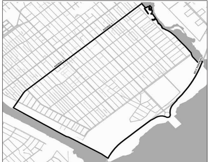
Map 3 Neighborhood Recovery Area in Brooklyn Community District 18