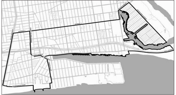
Map 2 Neighborhood Recovery Areas in Brooklyn Community Districts 13 and 15