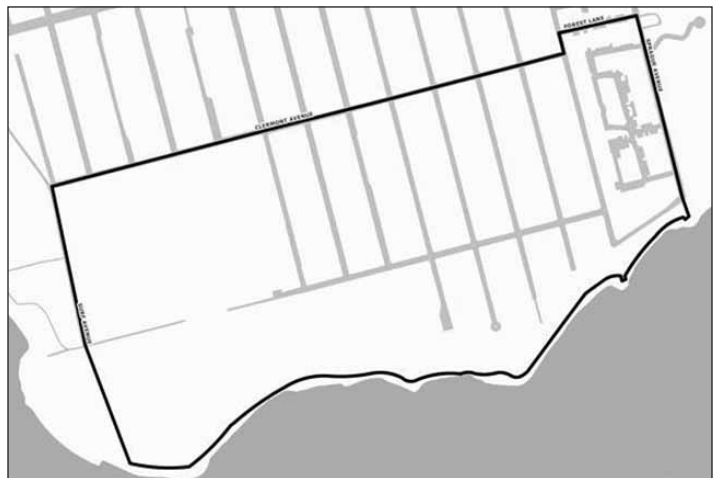
Map 9 Neighborhood Recovery Areas in Staten Island Community District 3 (2 of 2)

YVETTE V. GRUEL, Calendar Officer City Planning Commission 22 Reade Street, Room 2E, New York, NY 10007 Telephone (212) 720-3370