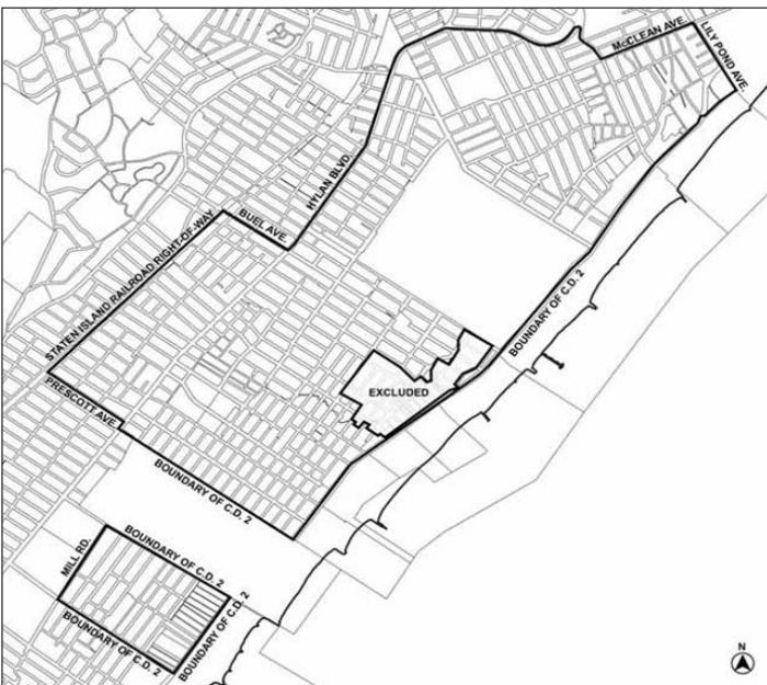
Map 7 Neighborhood Recovery Areas in Staten Island Community District 2

Areas designated by New York State as part of the NYS Enhanced Buyout Area Program are excluded from the neighborhood recovery areas and are designated on this map as "Excluded"