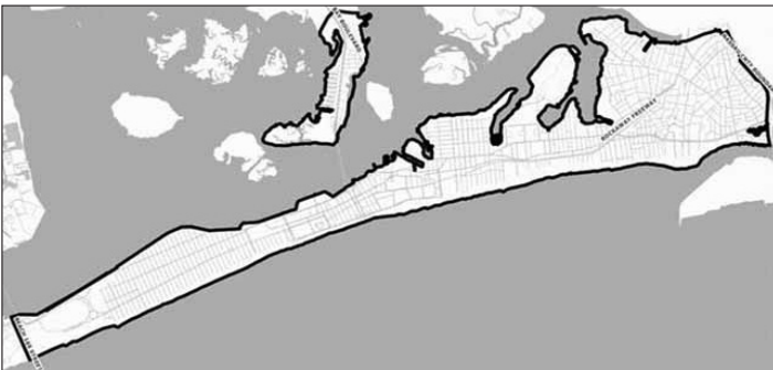
Map 6 Neighborhood Recovery Area in Queens Community District 14