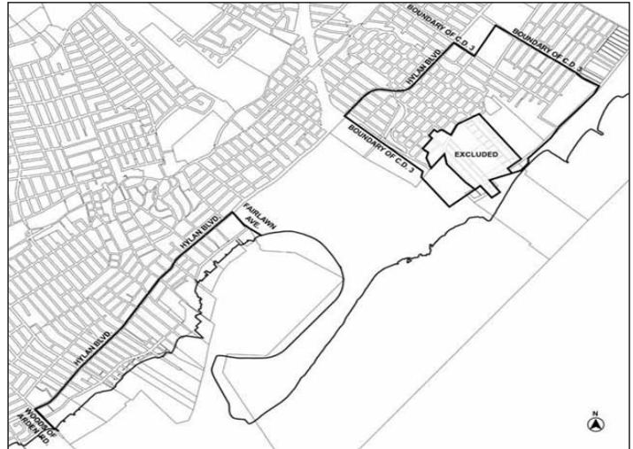
Map 8 Neighborhood Recovery Area in Staten Island Community District 3 (1 of 2)

Areas designated by New York State as part of the NYS Enhanced Buyout Area Program are excluded from the neighborhood recovery areas and are designated on this map as "Excluded"