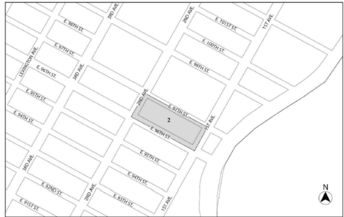
Mandatory Inclusionary Housing Program Area See Section 23-154(d)(3) Area 2 - [date of adoption] MIH Program Option 1