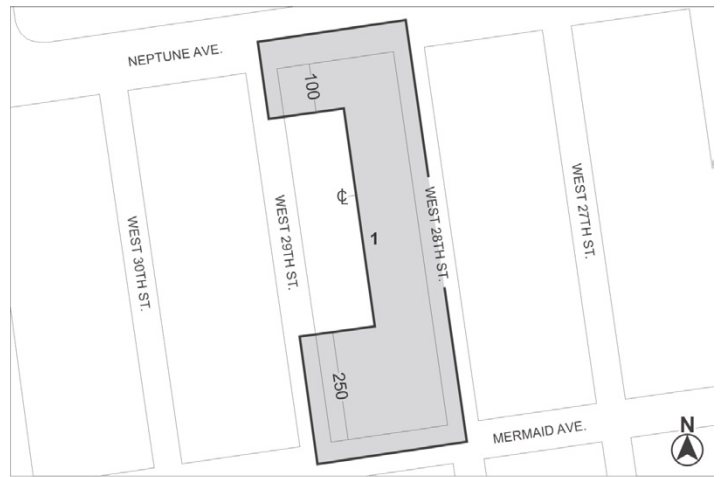
■ Mandatory Inclusionary Housing Area (see Section 23-154(d)(3))