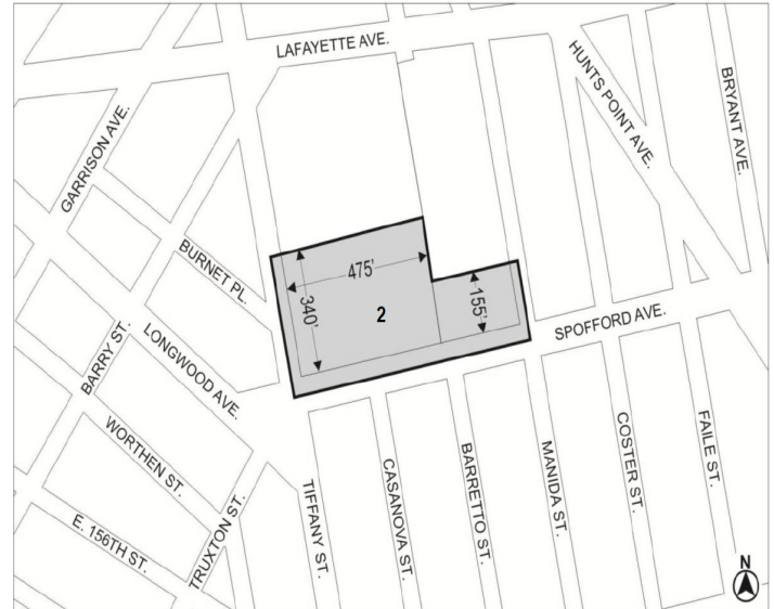
Mandatory Inclusionary Housing Program Area see Section 23-154(d)(3)

Area 2 - [date of adoption] - MIH Program Option 1 Portion of Community District 2, The Bronx