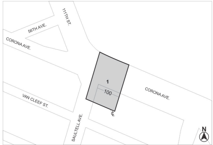
Mandatory Inclusionary Housing Area see Section 23-154(d)(3)

Area 1 — [date of adoption] — MIH Program Option 1 and Option 2