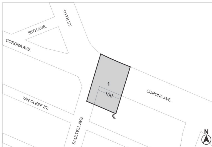
Mandatory Inclusionary Housing Area see Section 23-154(d)(3)

Area 1 — [date of adoption] — MIH Program Option 1 and Option 2