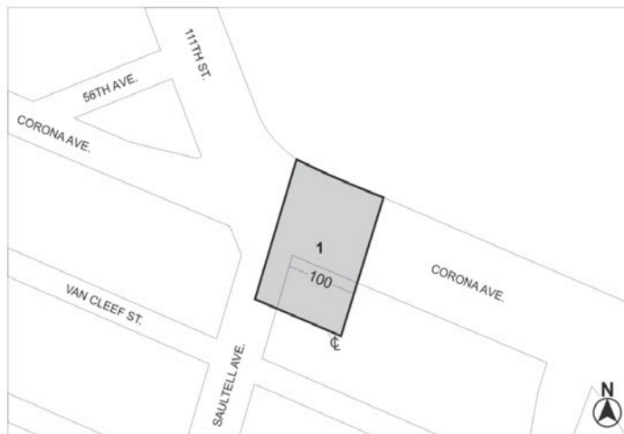
Mandatory Inclusionary Housing Area see Section 23-154(d)(3) Area 1 — [date of adoption] — MIH Program Option 1 and Option 2