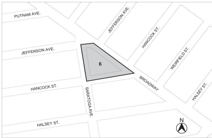
Mandatory Inclusionary Housing Program Area see Section 23-154(d)(3) Area 6— [date of adoption] - MIH Program Option 1 and 2

Portion of Community District 16, Brooklyn * * *