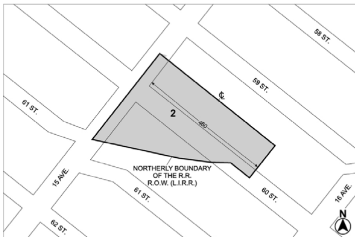
Mandatory Inclusionary Housing Program Area (see Section 23-154(d)(3)) Area 2 - [date of adoption] - MIH Program Option 1 and Option 2

Portion of Community District 12, Brooklyn * * *