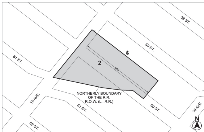
█ Mandatory Inclusionary Housing Program Area (see Section 23-154(d)(3)) Area 2 — [date of adoption] — MIH Program Option 1 and Option 2

Portion of Community District 12, Brooklyn