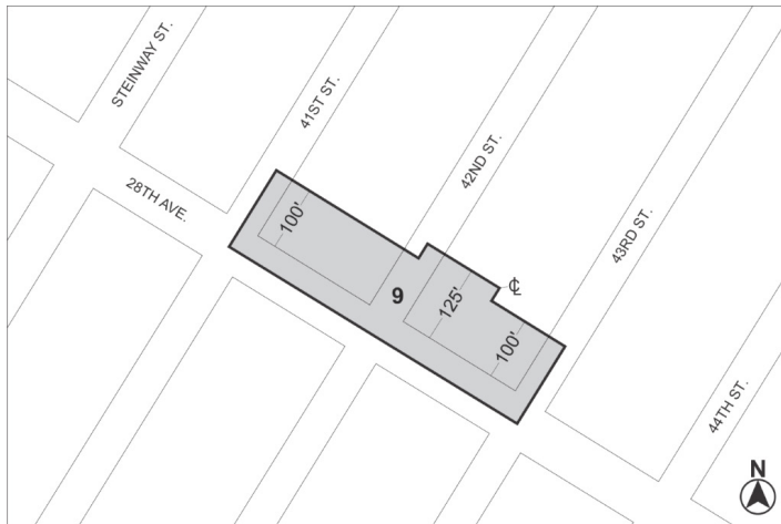
■ Mandatory Inclusionary Housing Area see Section 23-154(d)(3) Area 9 — [date of adoption] — MIH Program Option 1 and Option 2