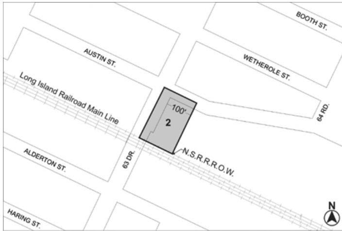
Area 2 — [date of adoption] — MIH Program Option 1 and Option 2