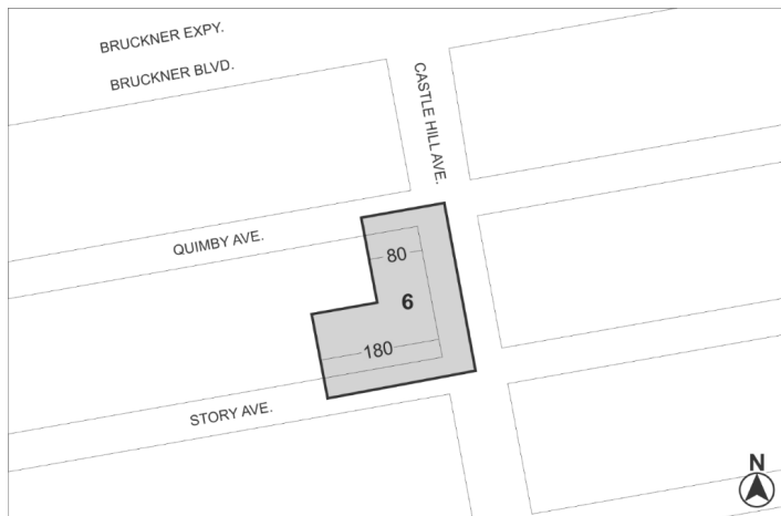
Mandatory Inclusionary Housing Program Area see Section 23-154(d)(3) Area 6 - [date of adoption] - MIH Program Option 1 and Option 2

Portion of Community District 9, The Bronx * * *