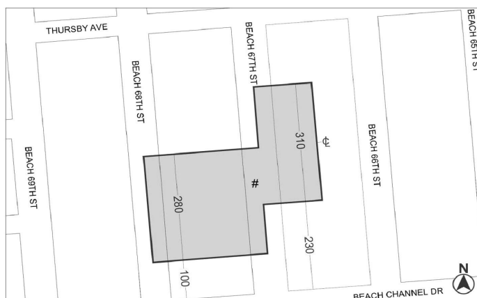
Mandatory Inclusionary Housing Area see Section 23-154(d)(3)