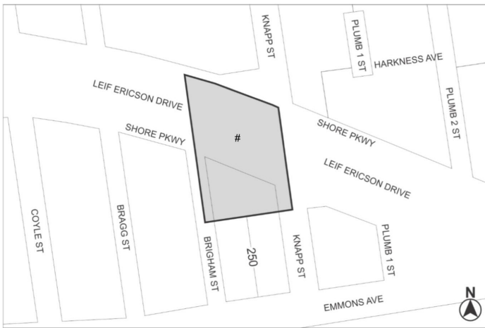
Map 2 [date of adoption]

Mandatory Inclusionary Housing Area (see Section 23-154(d)(3)) Area # — [date of adoption] — MIH Program Option 1 and Option 2