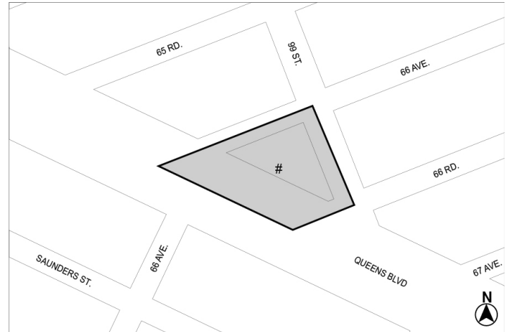
Mandatory Inclusionary Housing Program Area see Section 23-154(d)(3)