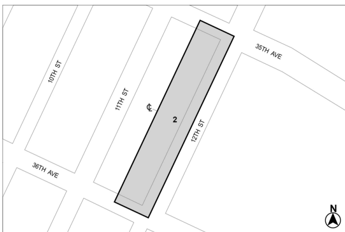
Mandatory Inclusionary Housing Program Area see Section 23-154(d)(3) Area 2 — 10/31/18 MIH Program Option 1 and Option 2