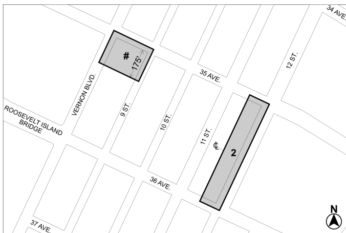
Mandatory Inclusionary Housing Area see Section 23-154(d)(3) Area 2 — 10/31/18 MIH Program Option 1 and Option 2 Area # — [date of adoption] — MIH Program Option 1