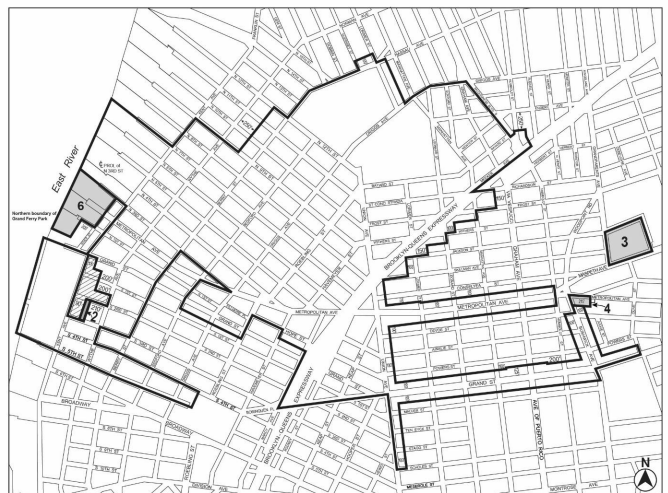
Inclusionary Housing designated area Mandatory Inclusionary Housing Program Area see Section 23-154(d)(3) Area 2-10/7/21 MIH Program Option 1 and Option 2 Area 3-11/23/21 MIH Program Option 1 and Deep Affordability Option Area 4-11/23/21 MIH Program Option 1 and Deep Affordability Option Area 6-12/15/21 MIH Program Option 1 Excluded Area