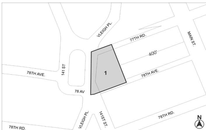
■ Mandatory Inclusionary Housing Area see Section 23-154(d)(3)