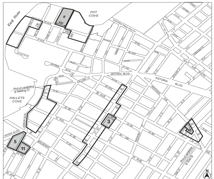
█ Inclusionary Housing designated area █ Mandatory Inclusionary Housing Program Area see Section 23-154(d)(3) Area 3 – 10/31/18 MIH Program Option 1 and Option 2 Area 5 – 10/17/19 MIH Program Option 1 Area 10 – 6/17/21 MIH Program Option 1 Area 11 – 10/21/21 MIH Program Option 1 Area # - [date of adoption] MIH Program Option 1