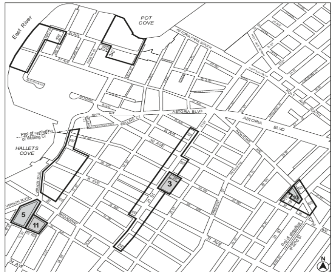
█ Inclusionary Housing designated area █ Mandatory Inclusionary Housing Program Area see Section 23-154(d)(3) Area 3 – 10/31/18 MIH Program Option 1 and Option 2 Area 5 – 10/17/19 MIH Program Option 1 Area 10 – 6/17/21 MIH Program Option 1 Area 11 – 10/21/21 MIH Program Option 1