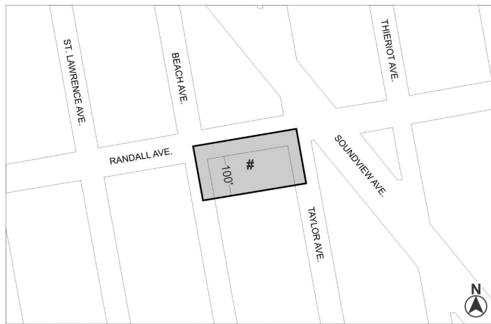
█ Mandatory Inclusionary Housing Area see Section 23-154(d)(3) Area # — [date of adoption] — MIH Program Option 1 and Option 2

Portion of Community District 9, The Bronx