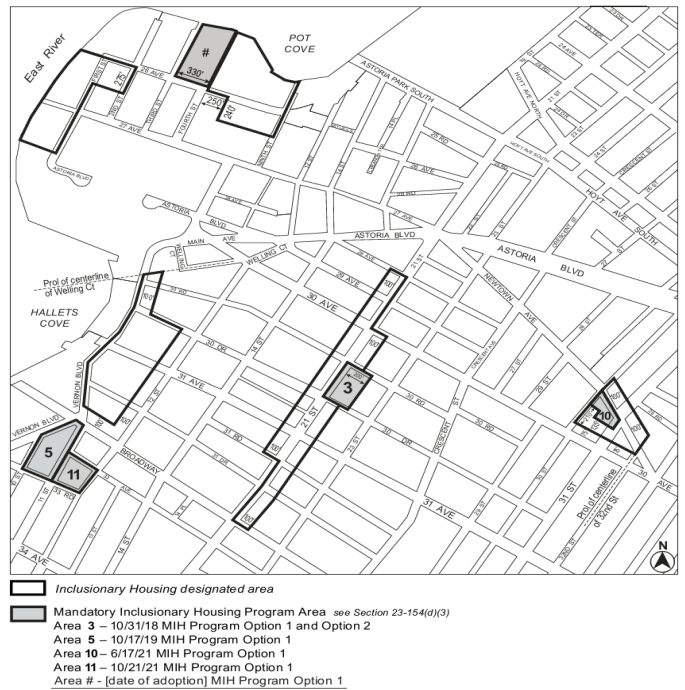
Portion of Community District 1, Queens