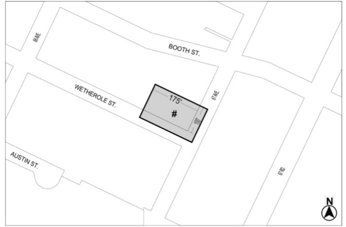
Map 5– [date of adoption]

█ Mandatory Inclusionary Housing Area see Section 23-154(d)(3)