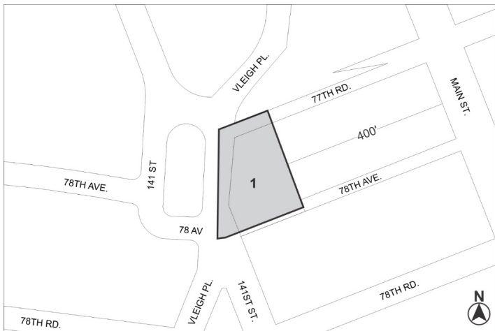
Mandatory Inclusionary Housing Area see Section 23-154(d)(3) Area 1 - [date of adoption] - MIH Program Option 1 and Option 2