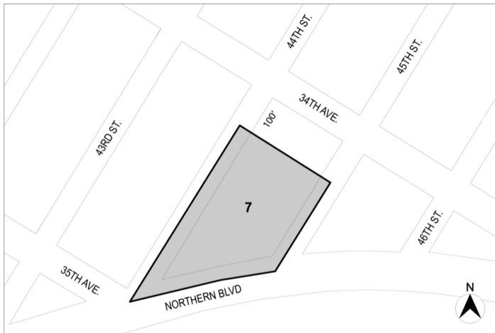
Map 7 — (11/14/19)

Mandatory Inclusionary Housing Program Area see Section 23-154(d)(3) Area 7 (11/14/19) — MIH Program Option 1