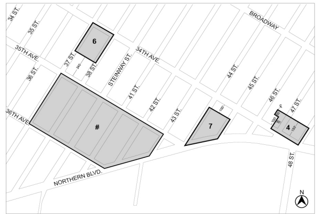
Mandatory Inclusionary Housing Program Area see Section 23-154(d)(3) Area 4 — 5/29/19 MIH Program Option 2 Area 6 — 10/17/19 MIH Program Option 1 Area 7 — 11/14/19 MIH Program Option 1 Area # — [date of adoption] MIH Program Option 1