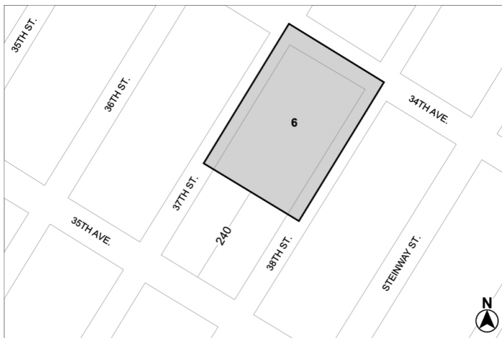
Mandatory Inclusionary Housing Program Area see Section 23-154(b)(3) Area 6 — (10/17/19) MIH Program Option 1