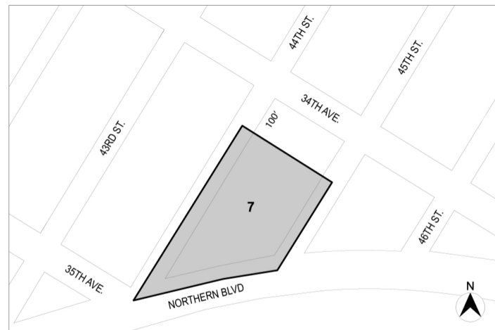
Mandatory Inclusionary Housing Program Area see Section 23-154(d)(3) Area 7 (11/14/19) — MIH Program Option 1