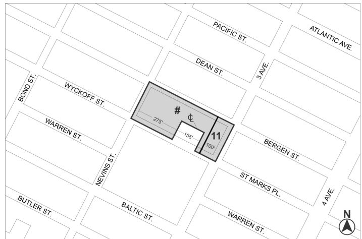
█ Mandatory Inclusionary Housing Area see Section 23-154(d)(3) Area 11 — 6/16/22 — MIH Program Option 1 and Option 2 Area # — [date of adoption] — MIH Program Option 1 and Option 2

Portion of Community District 2, Brooklyn