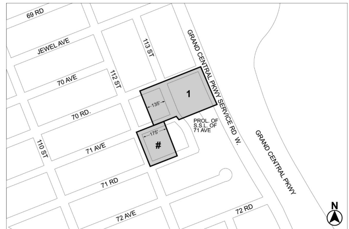
Mandatory Inclusionary Housing Program Area see Section 23-154(d)(3) Area 1 – 4/9/19 MIH Program Option 1 Area # – [date of adoption] MIH Program Option 1 and Option 2